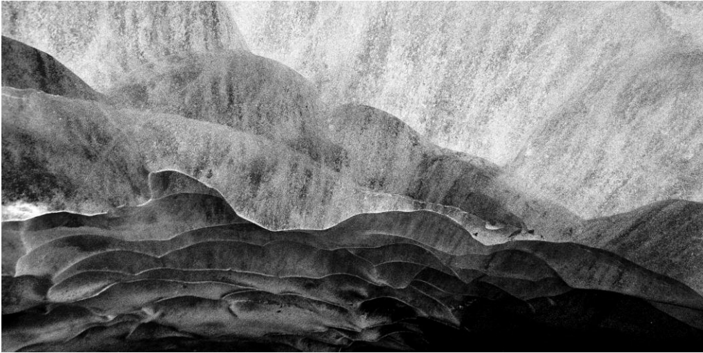
01 © Julia Calfee