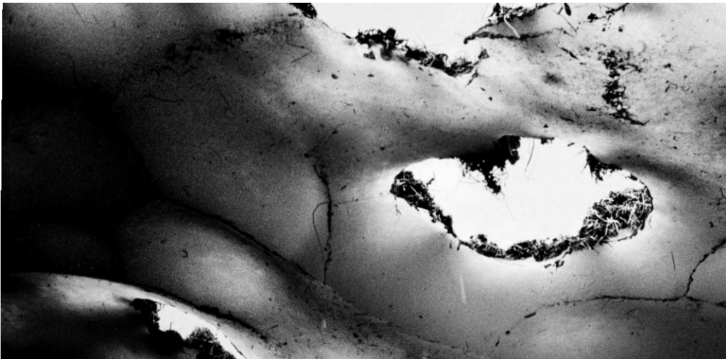
02 © Julia Calfee