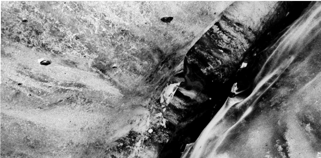
05 © Julia Calfee