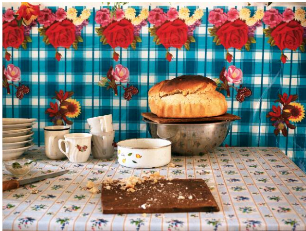
3 © Andrea Diefenbach