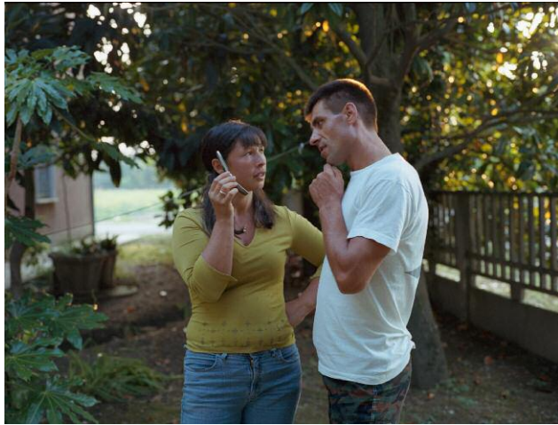
1 © Andrea Diefenbach