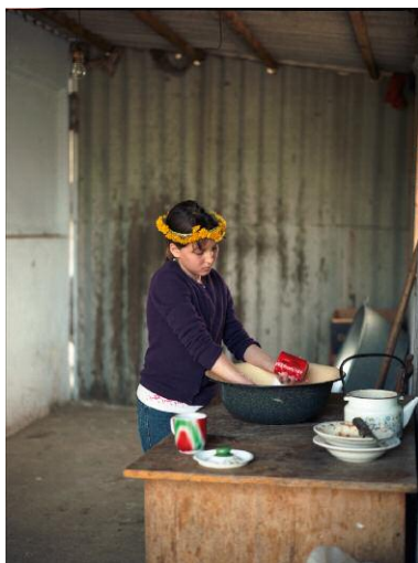
11