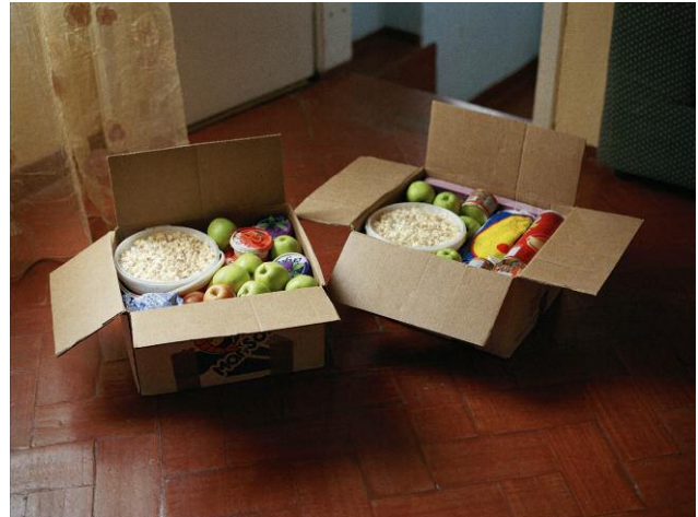
10 © Andrea Diefenbach