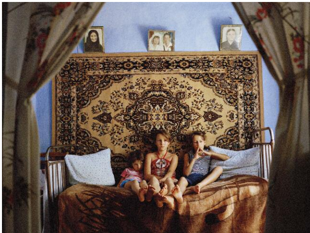
9 © Andrea Diefenbach