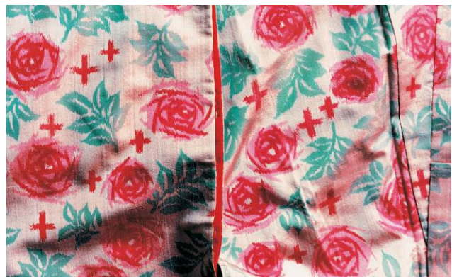
12. MIYAKO ISHIUCHI, SILKEN DREAMS # 27, 2009–2012. © MIYAKO ISHIUCHI