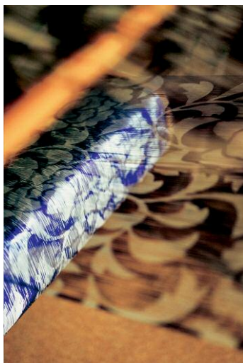
11. MIYAKO ISHIUCHI, SILKEN DREAMS # 1, 2009–2012.