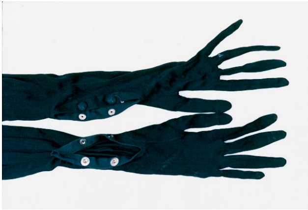
7. MIYAKO ISHIUCHI, FRIDA BY ISHIUSHI # 86, 2012. © MIYAKO ISHIUCHI