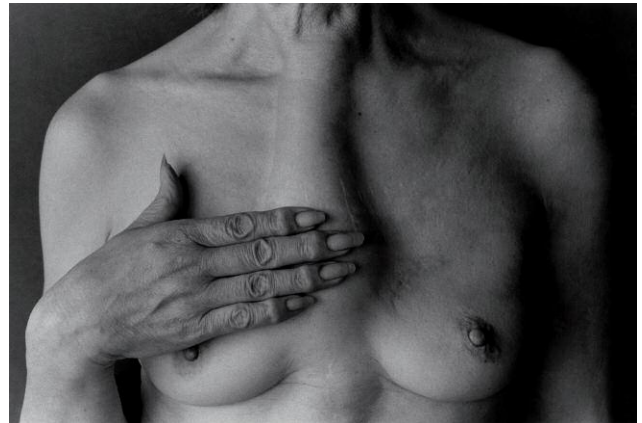
4. MIYAKO ISHIUCHI, INNOCENCE # 14, 1994–2007.