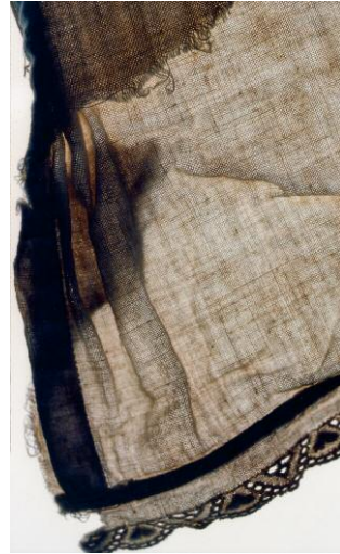
2. MIYAKO ISHIUCHI, HIROSHIMA # 14, 2007. © MIYAKO ISHIUCHI