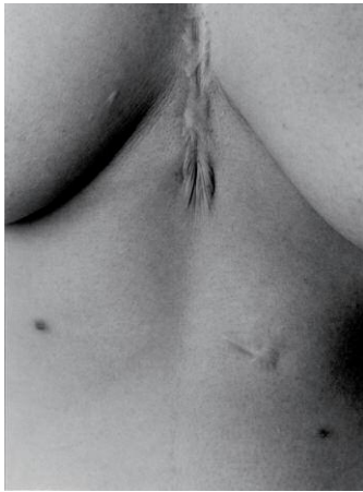
3. MIYAKO ISHIUCHI, INNOCENCE # 14, 1994–2007. © MIYAKO ISHIUCHI