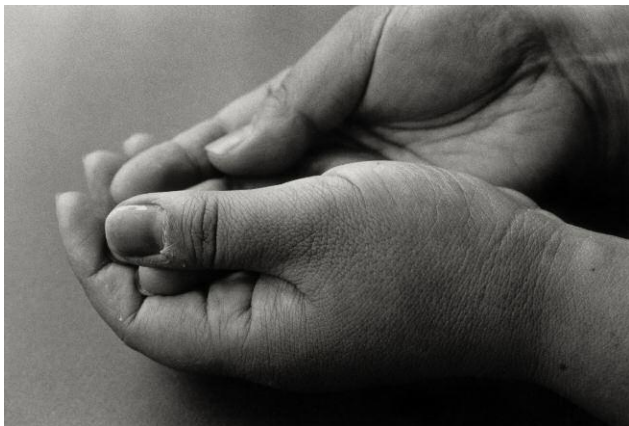
5. MIYAKO ISHIUCHI, 1-9-4-7 # 50, 1988–1989. © MIYAKO ISHIUCHI