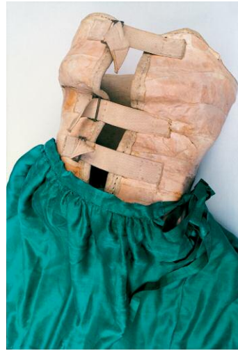
8. MIYAKO ISHIUCHI, FRIDA BY ISHIUSHI # 16, 2012. © MIYAKO ISHIUCHI