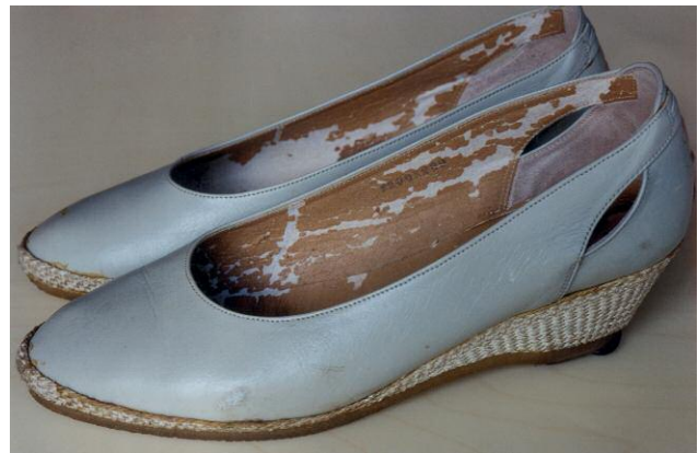
10. MIYAKO ISHIUCHI, MOTHER'S # 52, 2000–2005.