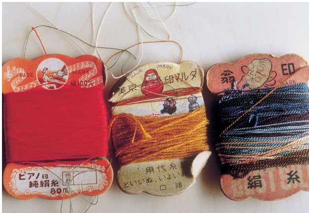
9. MIYAKO ISHIUCHI, MOTHER'S # 58, 2000–2005. © MIYAKO ISHIUCHI