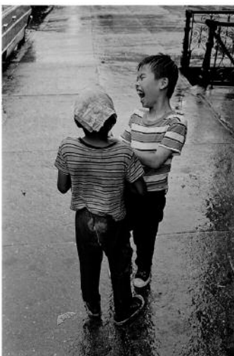
05_Avenue B, East Village, New York City, 1967 © James Carroll