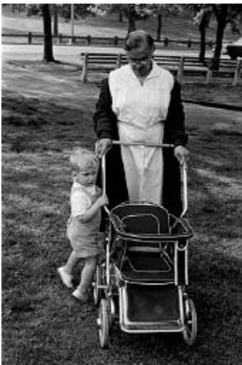
09_Central Park, New York City, 1966