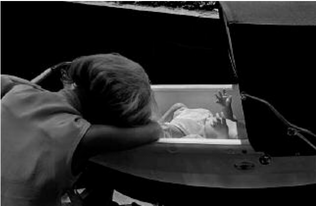
01_Riverside Drive, New York City, 1966 © James Carroll