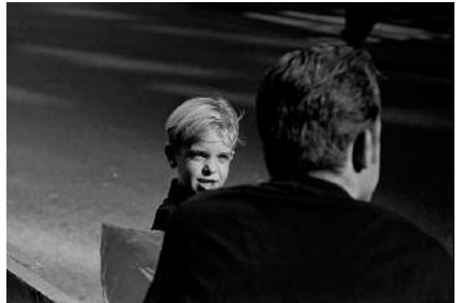
10_Parade, 5th Ave., New York City, 1995