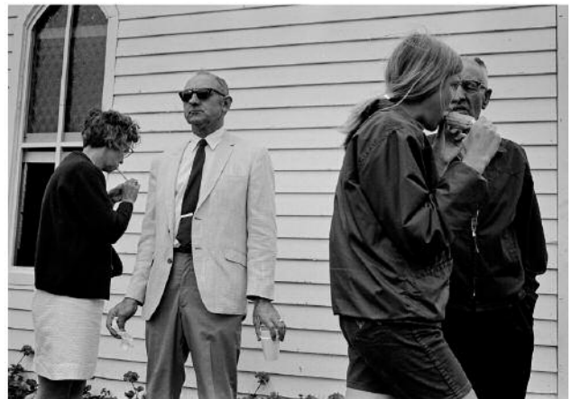
04_Kutztown Folk Festival, Pennsylvania, 1970