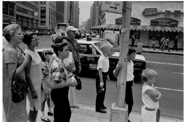
12_Near Times Square, New York City, 1967