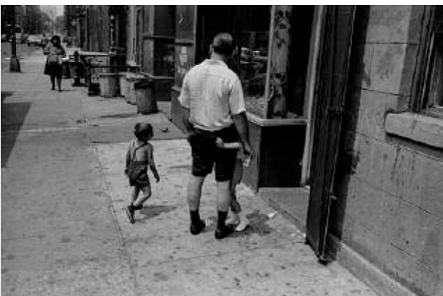
11_Avenue A, East Village, New York City, 1967 © James Carroll