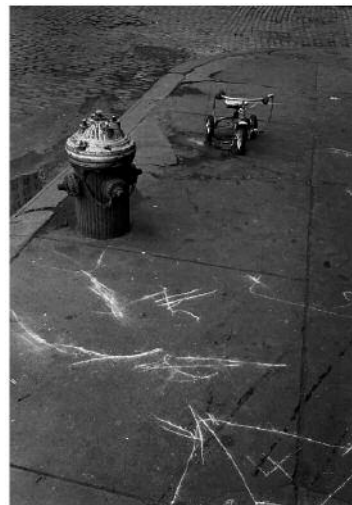
06_Water St., New York City, 1965