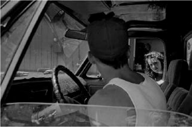
07_Sparks, Nevada, 1990 © James Carroll