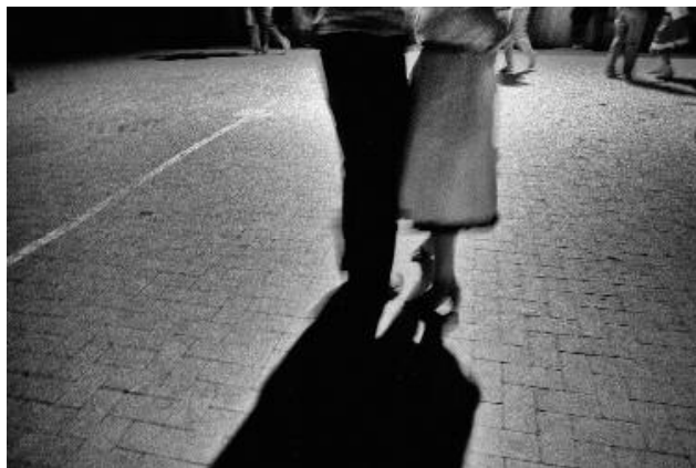
5 © MAURO MARINELLI