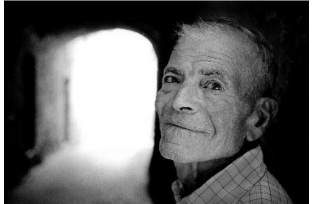
14 © MAURO MARINELLI