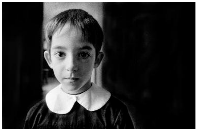
12 © MAURO MARINELLI