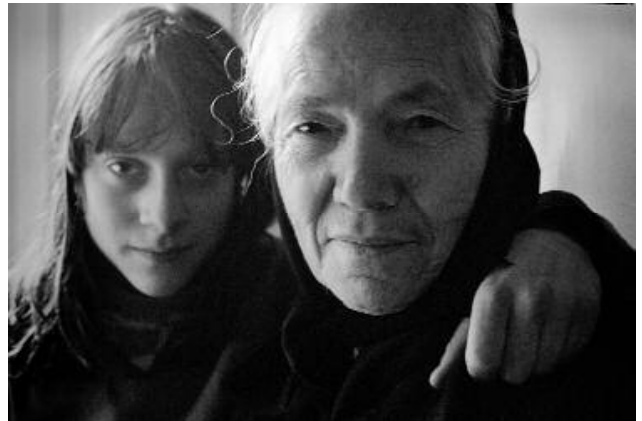
18 © MAURO MARINELLI