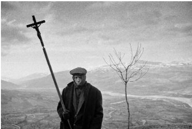
17 © MAURO MARINELLI