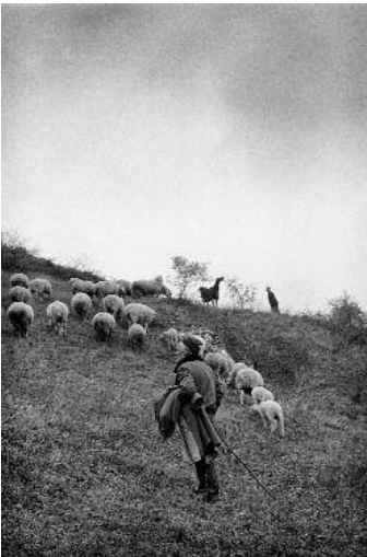
21 © MAURO MARINELLI