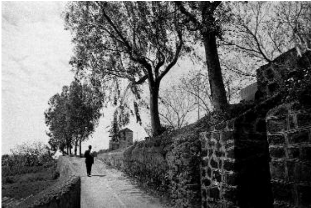
15 © MAURO MARINELLI