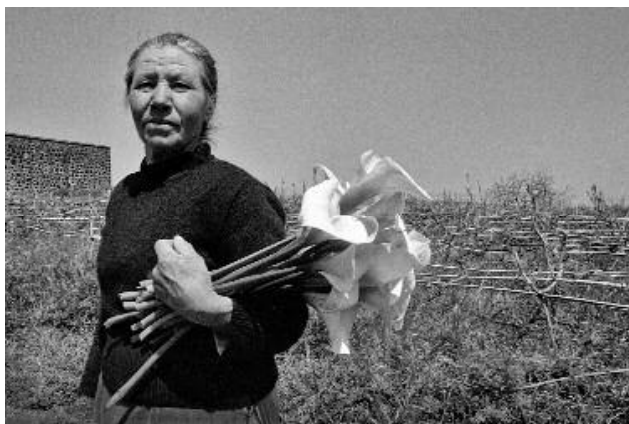
23 © MAURO MARINELLI