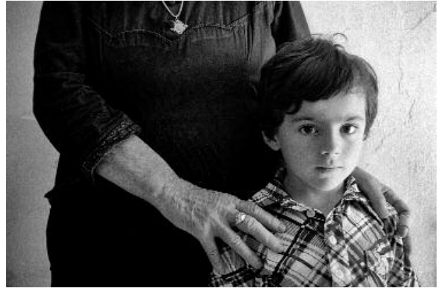
2 © MAURO MARINELLI