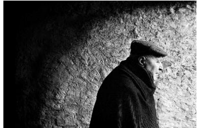
16 © MAURO MARINELLI