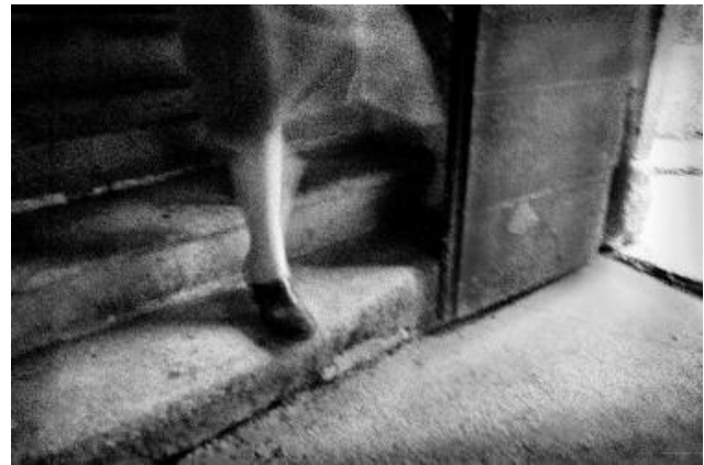
10 © MAURO MARINELLI