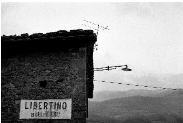
11