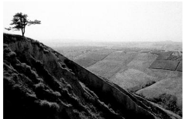
22 © MAURO MARINELLI