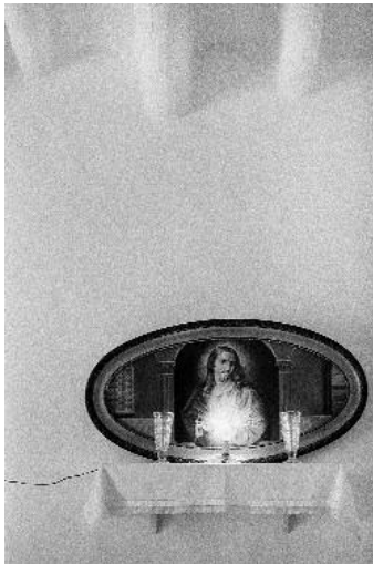
3 © MAURO MARINELLI