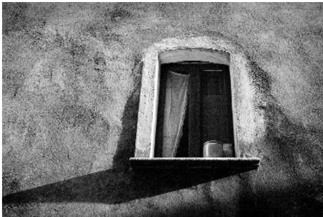
9 © MAURO MARINELLI