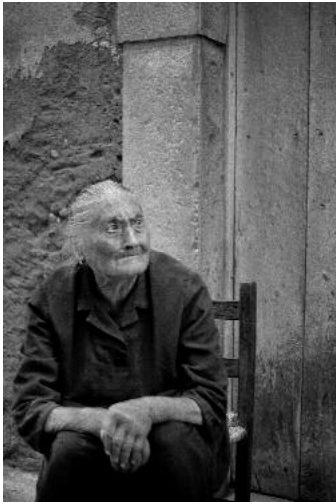
19 © MAURO MARINELLI