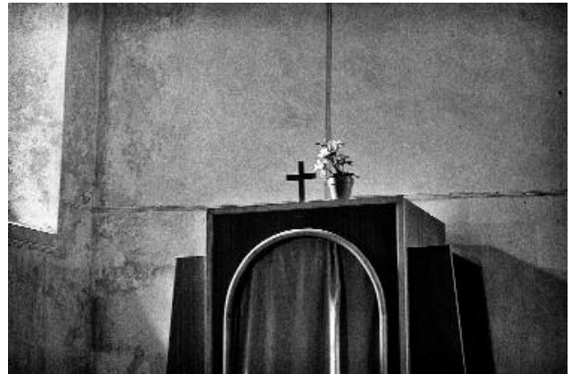
4 © MAURO MARINELLI