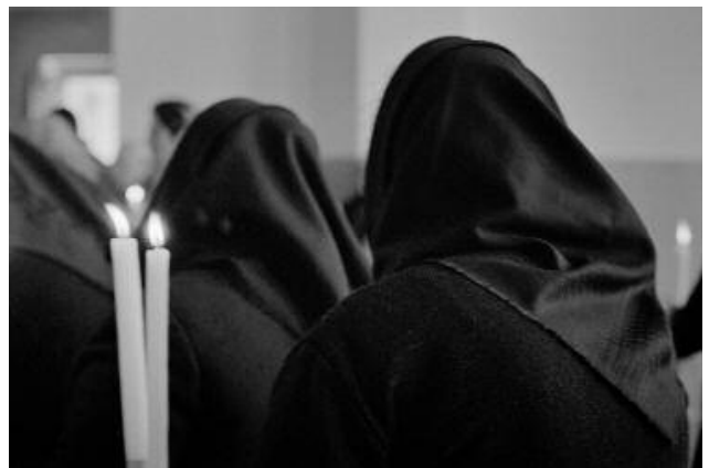
24 © MAURO MARINELLI