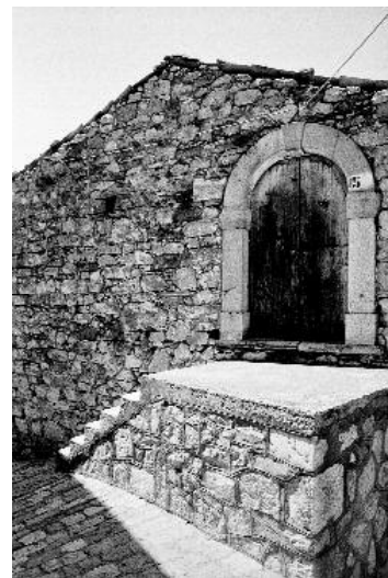
6 © MAURO MARINELLI