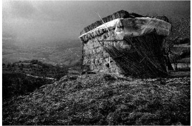
8 © MAURO MARINELLI