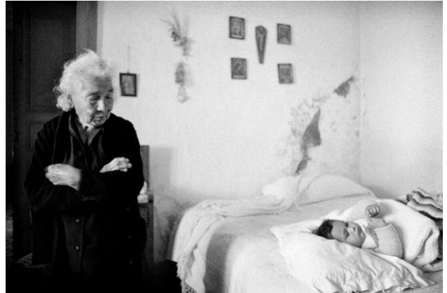
20 © MAURO MARINELLI