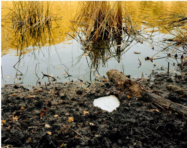
09 © Ahndraya Parlato