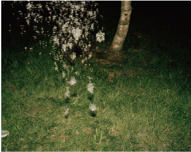
01 © Ahndraya Parlato