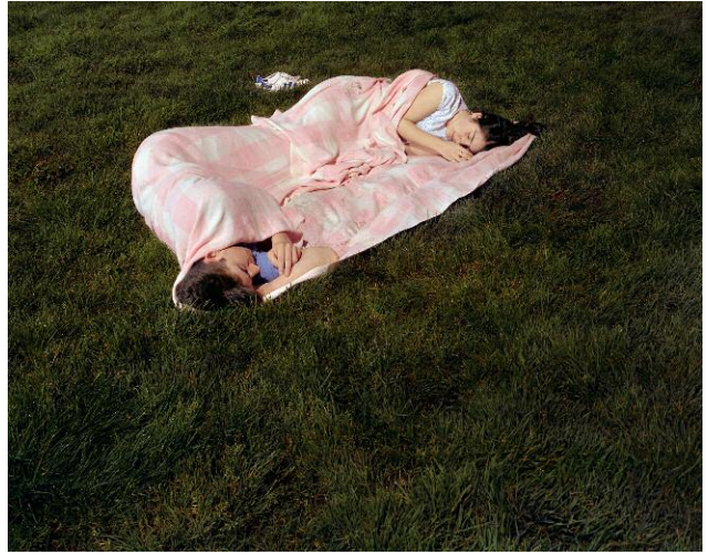
08 © Ahndraya Parlato