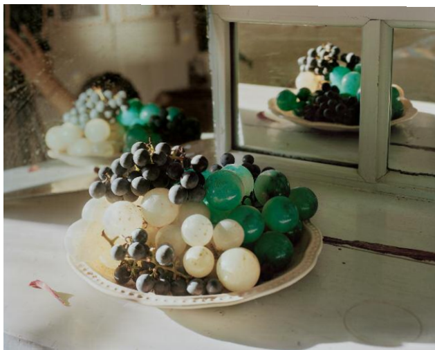
03 © Ahndraya Parlato