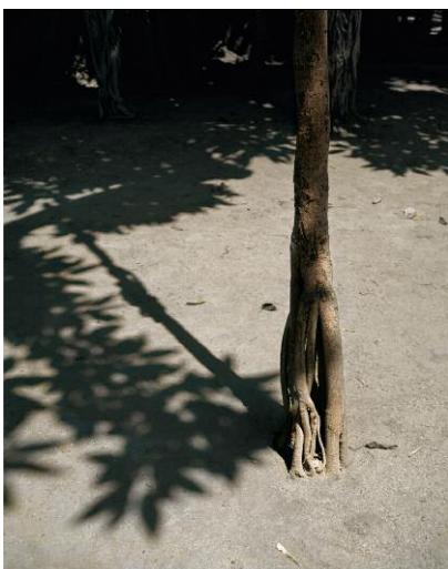
05 © Ahndraya Parlato