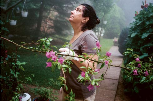
01_ © Ghaleb Cabbabé