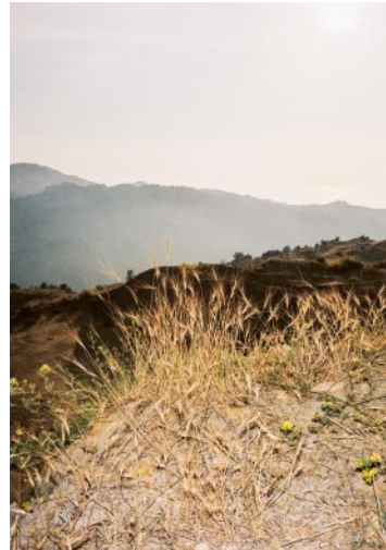
08_ © Ghaleb Cabbabé