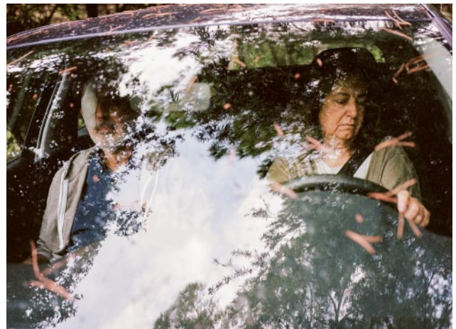
10_ © Ghaleb Cabbabé