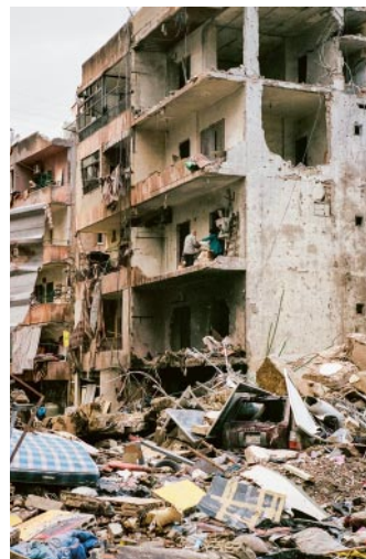
06_ © Ghaleb Cabbabé