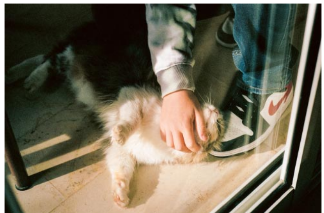
12_ © Ghaleb Cabbabé