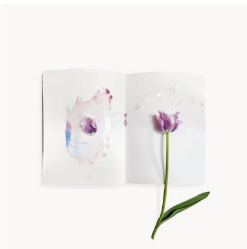
05_ Peace study, blue purple. 2022