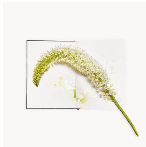
06_ Peace study, pale green. 2022