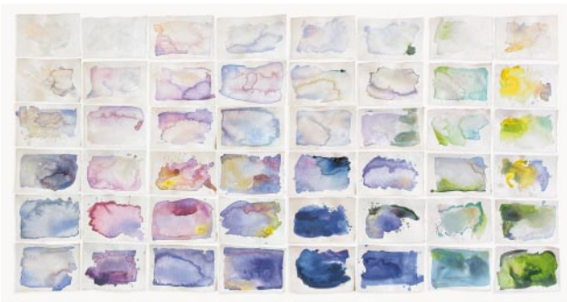
03_ Iris. 2022