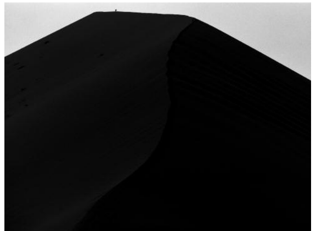
06 Untitled , from the series Omatandangole