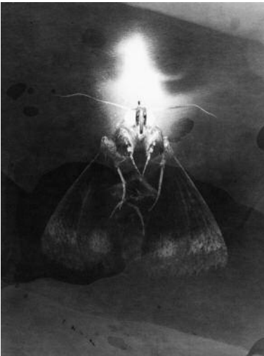
01 Untitled , from the series Omatandangole