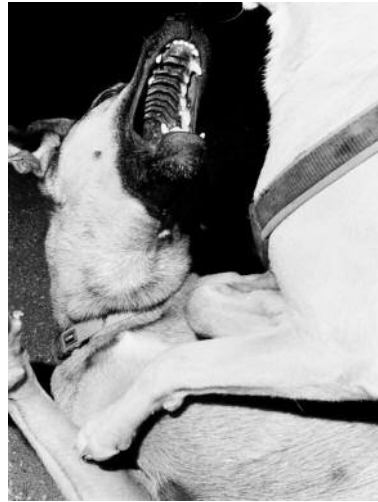
08 Untitled , from the series Omatandangole