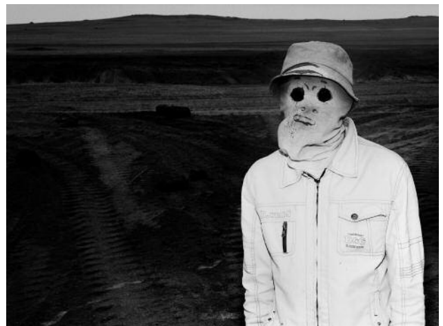
04 Untitled , from the series Omatandangole © Aapo Huhta