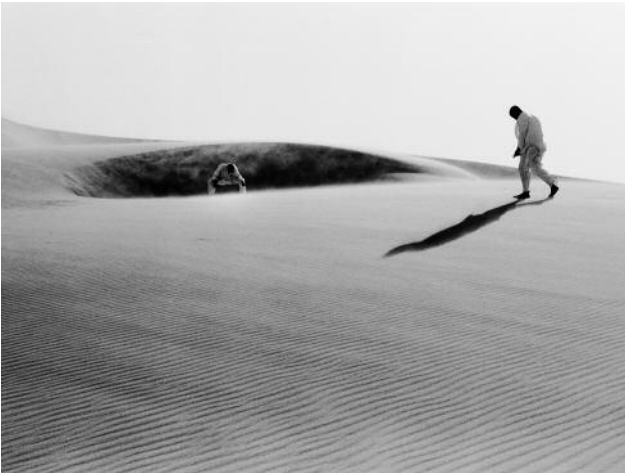
07 Untitled , from the series Omatandangole