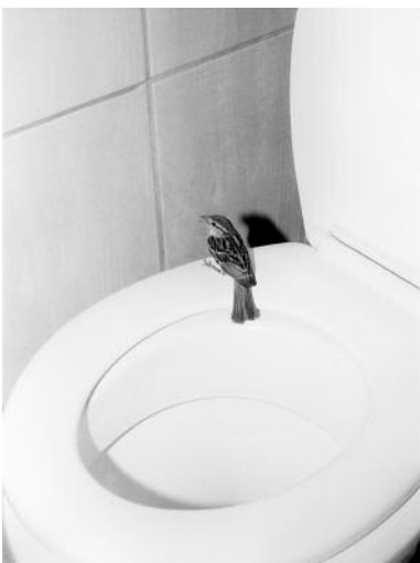
05 Untitled , from the series Omatandangole