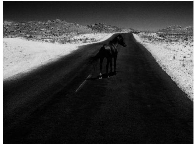
02 Untitled , from the series Omatandangole