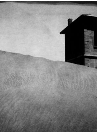
09 Untitled , from the series Omatandangole