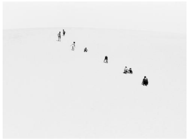
10 Untitled , from the series Omatandangole © Aapo Huhta