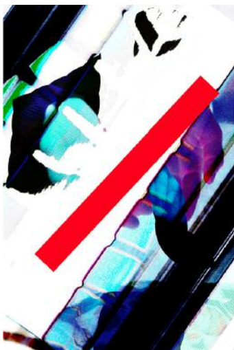
05_ This Is Doubt IX, Nothing Compares, 2014 © Absalon Kirkeby