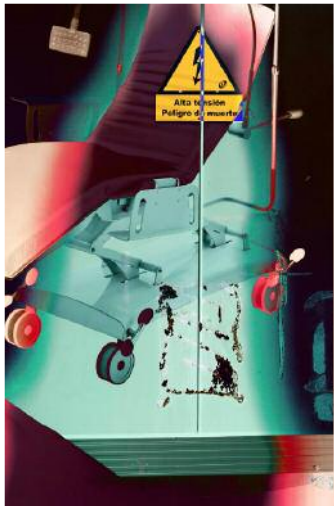
03_ Blood Pressure IV, Spain, 2016