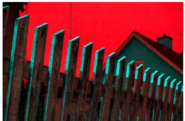
06_ This Is Magic XIII, Måløv, 2018 © Absalon Kirkeby