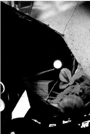
09_ This Is the Garden XIII, Rotten 2, Måløv, 2017 © Absalon Kirkeby