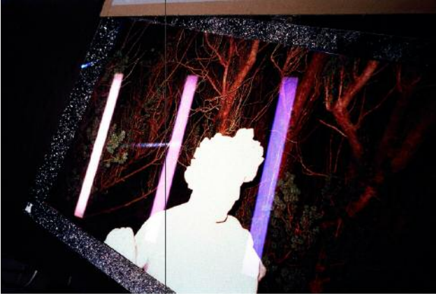
01_This Is the Ground V, Figur (streger), Billedhuggerhaven, 2012 © Absalon Kirkeby