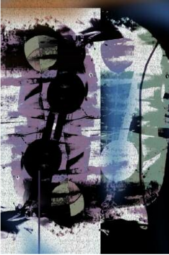
07_ Trying to Forget XI, 2017 © Absalon Kirkeby