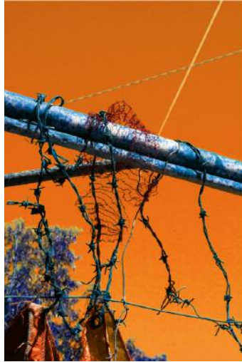
10_ This Is the Sorrow V, Albenga, 2015 © Absalon Kirkeby