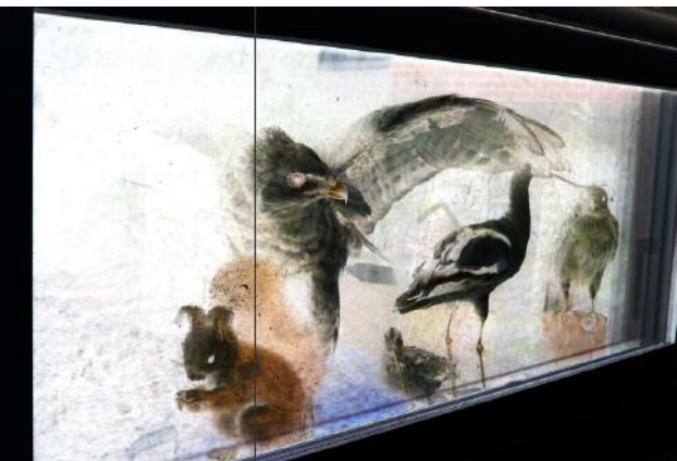
11_ To Be Forgotten IV, Hvide Sande, 2017 © Absalon Kirkeby