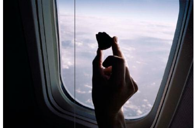
02_This Is the Ground VII, Sort Materie, 2010 © Absalon Kirkeby