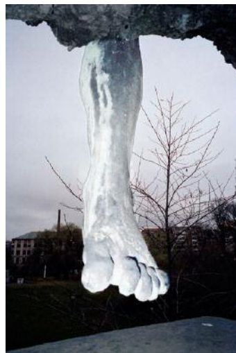
12_ This Is Life V, FOD, Sweden, 2008 © Absalon Kirkeby