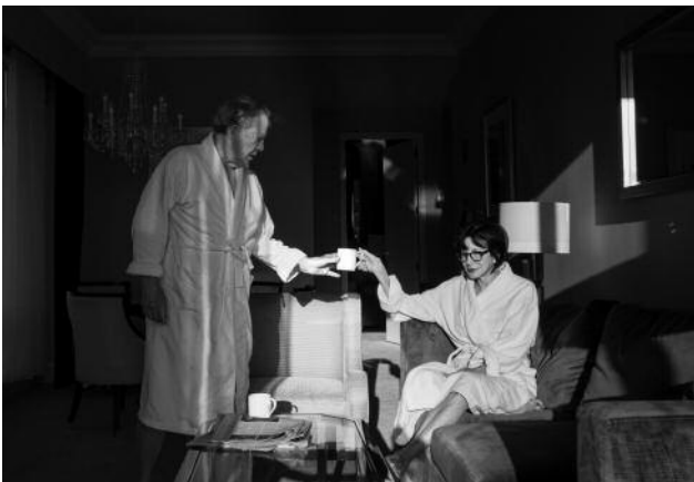
03_ © Aimee McCrory