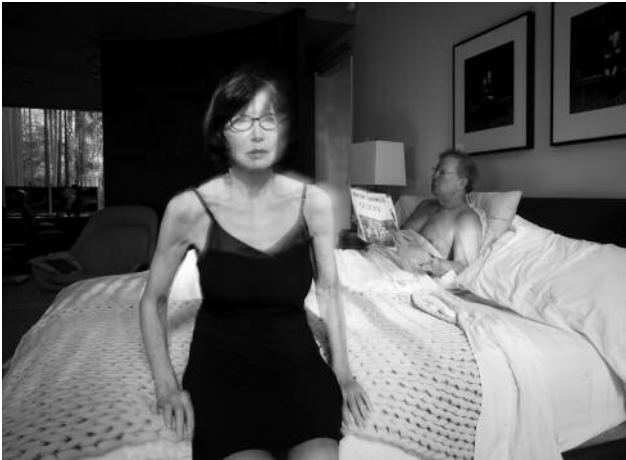
01_ © Aimee McCrory