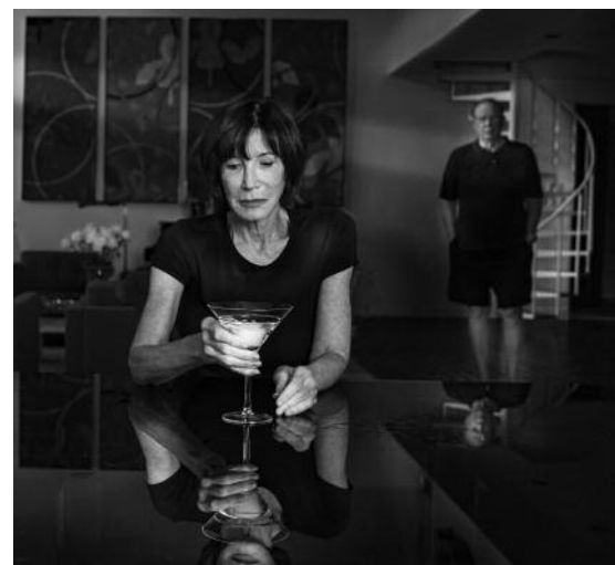
06_ © Aimee McCrory