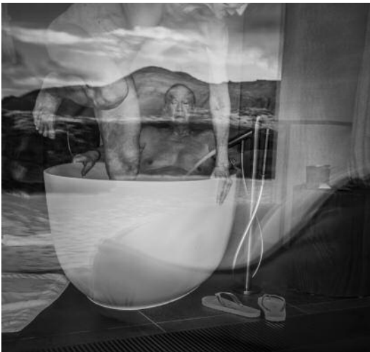
09_ © Aimee McCrory