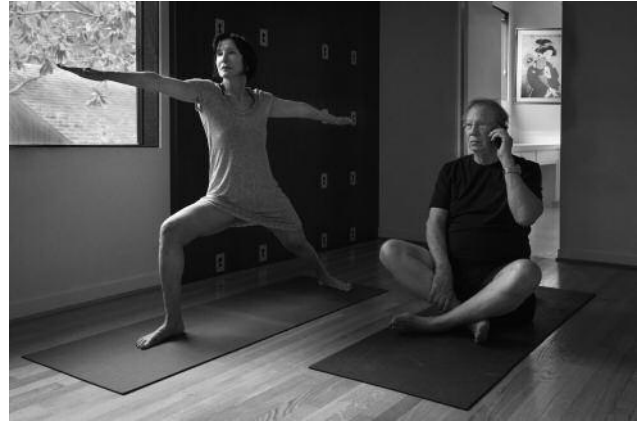
08_ © Aimee McCrory