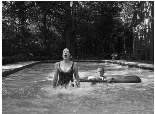
02_ © Aimee McCrory