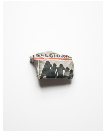
4.