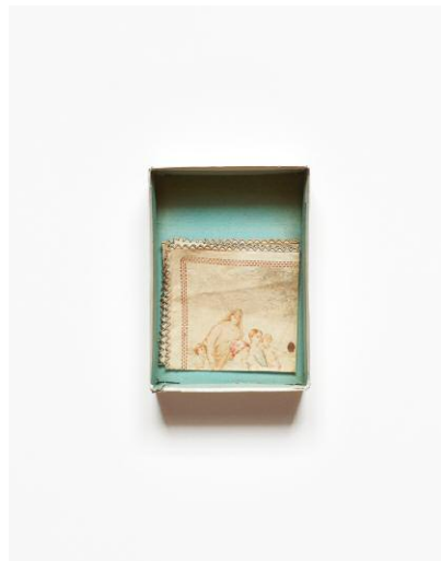
6.