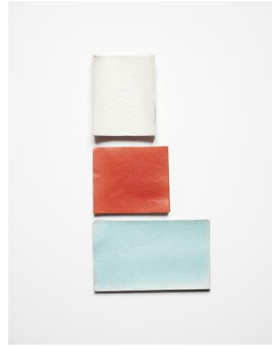
8