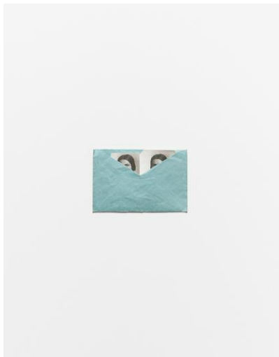
3.