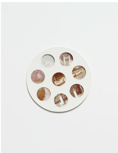
11