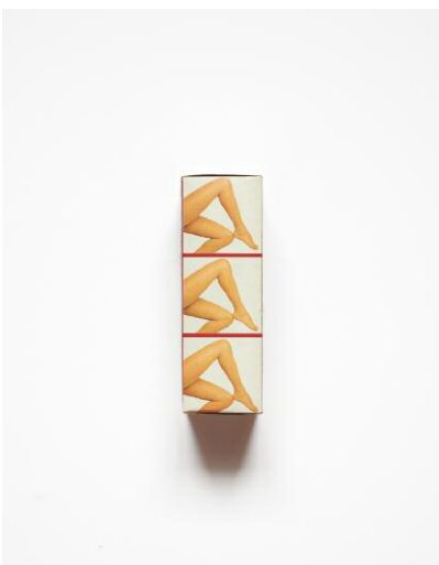
5. © Andrea Ferrari