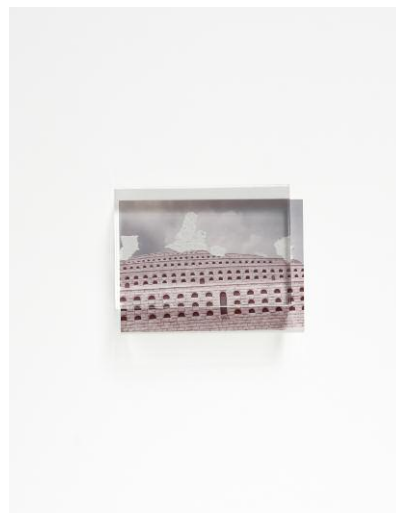
12