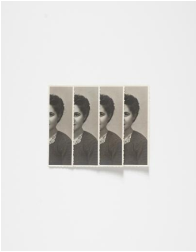
7