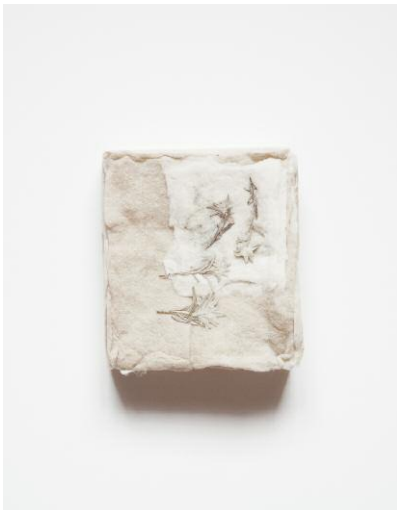
9