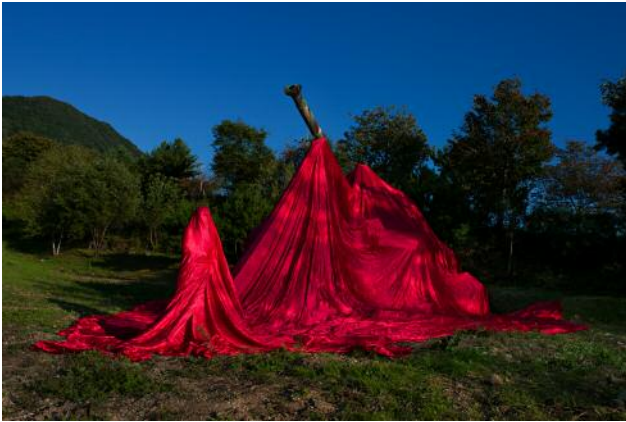
01 Rehearsal of Anxiety, Action #5 © Anna Lim