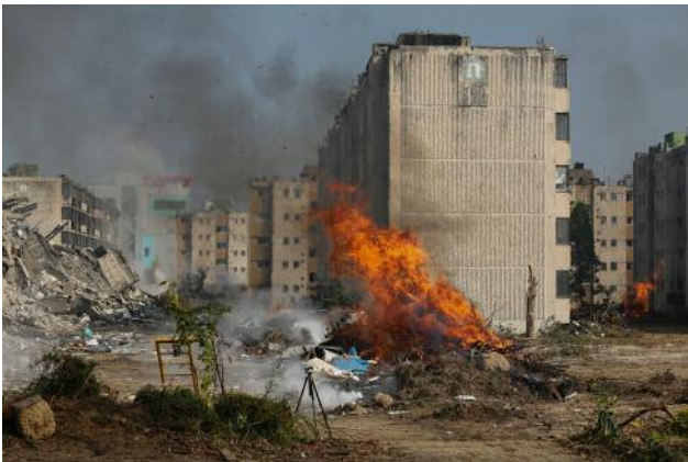
05 Simulation of Tragedy, #6 © Anna Lim