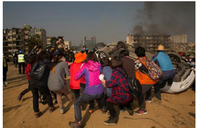
10 Simulation of Tragedy, #27 © Anna Lim