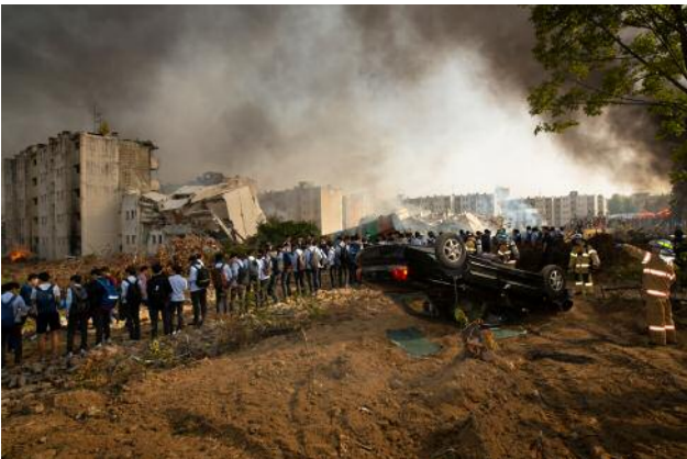
09 Simulation of Tragedy, #4 © Anna Lim