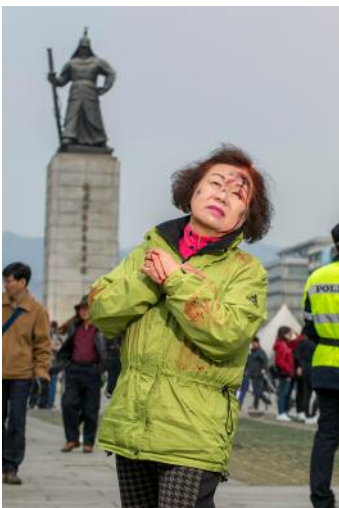
11 Rehearsal of Anxiety, Monologue #24 (L)