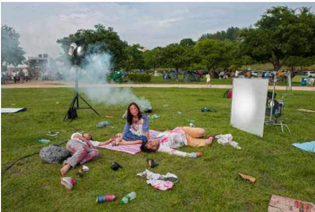
03 Rehearsal of Anxiety, Scene #3 © Anna Lim