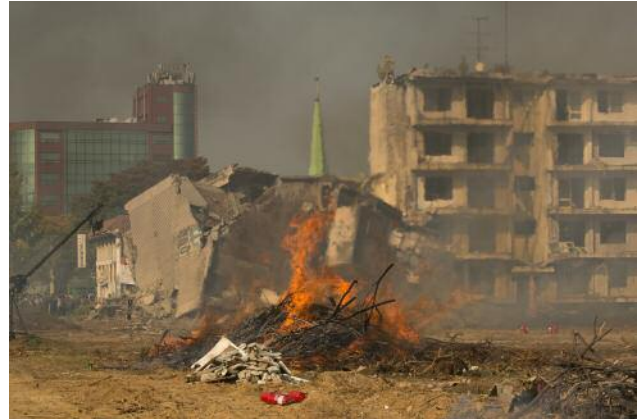
08 Simulation of Tragedy, #3 © Anna Lim