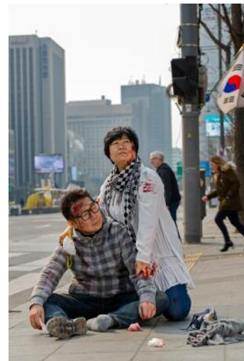
12 Rehearsal of Anxiety, Duet #6 b (R)