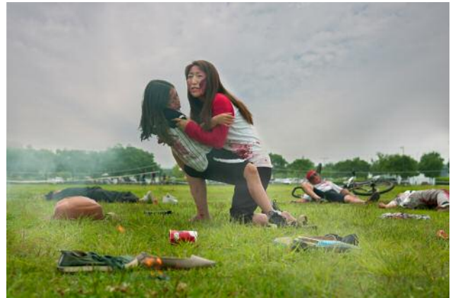
02 Rehearsal of Anxiety, Action #10