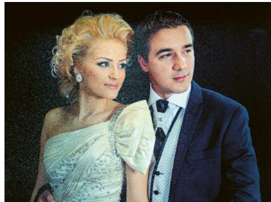
04_