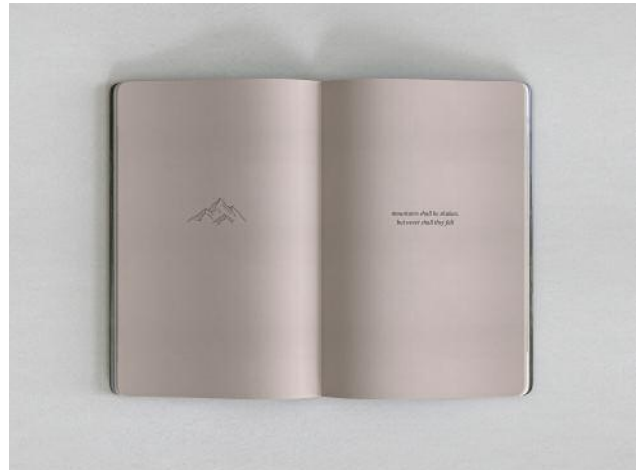
12_