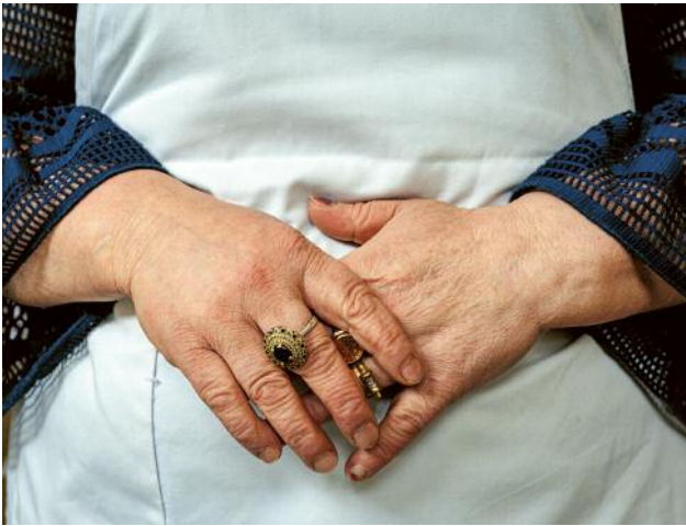
09_