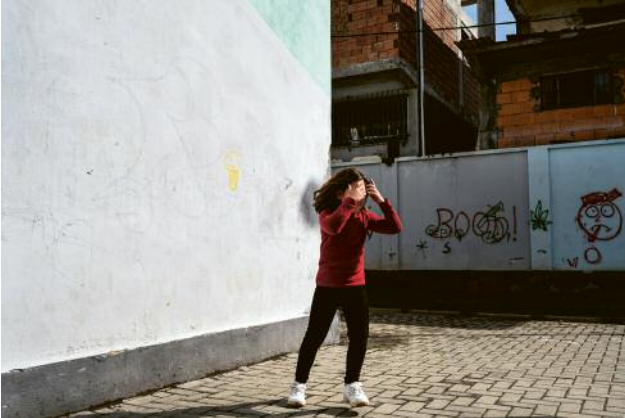
01_