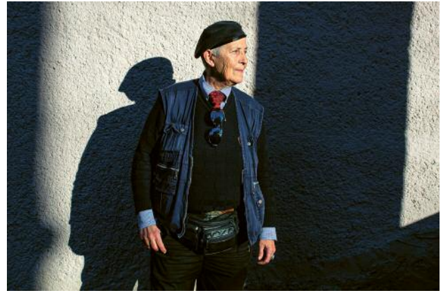
10_