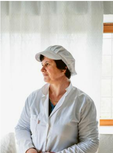
03_ © Anne Ackermann