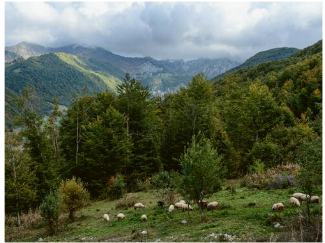
02_