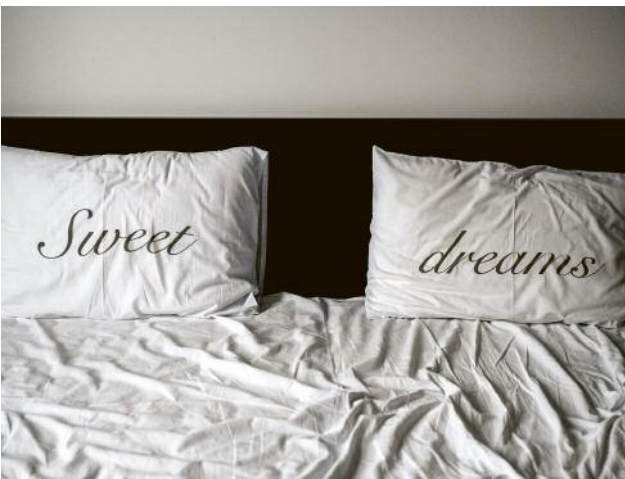
05_