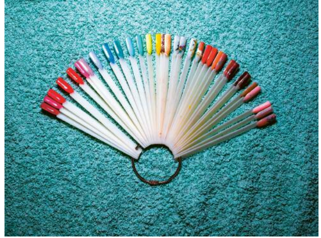
08_