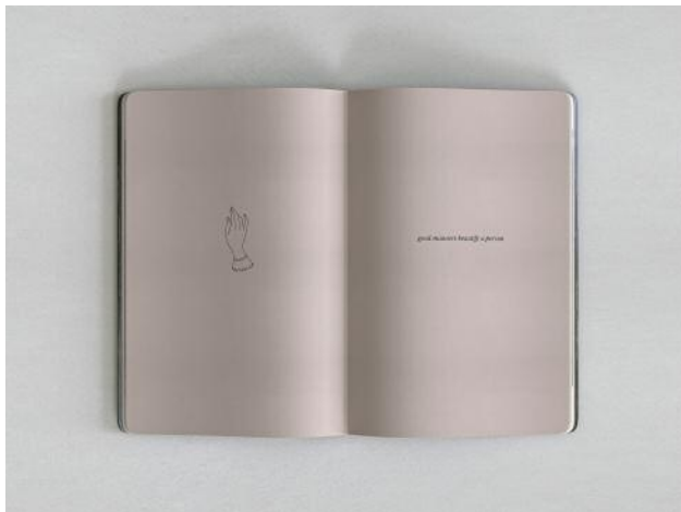
11_