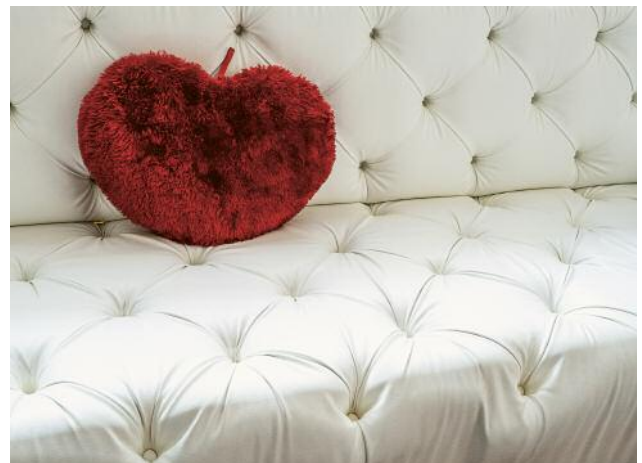
06_