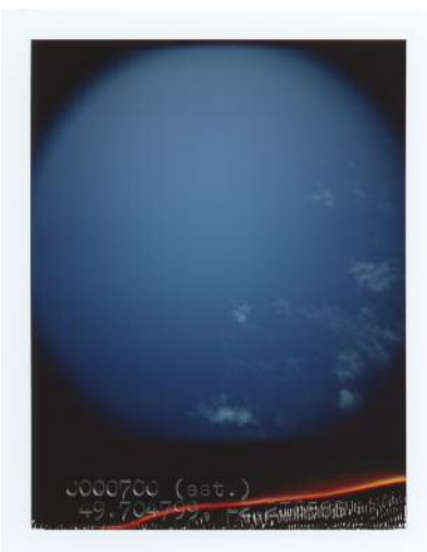
11_Alderney (Kanalinsel) (SS-BB I) | 0000700 (est.) | 49.704799, -2.218568 (EX) from The Blue Skies Project. FP-100C peel-apart instant film