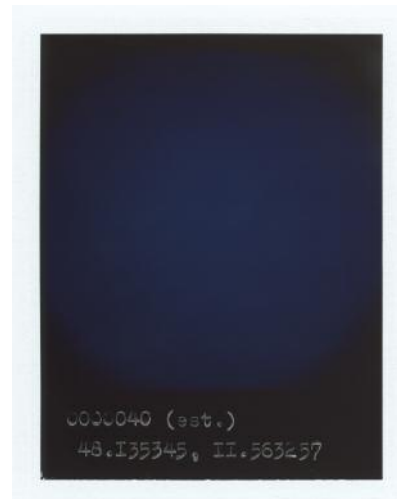
04_München (Lebensborn e.v.) | 0000040 (est.) | 48.135345, 11.563257 (EX) from The Blue Skies Project. FP-100C peel-apart instant film