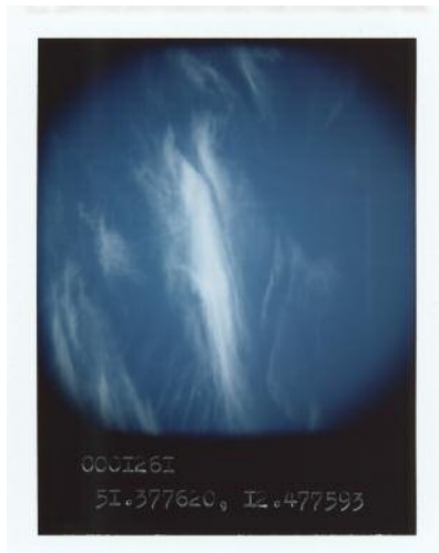
03_Taucha | 0001261 | 51.377620, 12.477593 (EX) from The Blue Skies Project. FP-100C peel-apart instant film