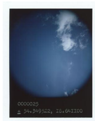
10_Danzig (Schulemann) | 0000025 | 54.349522, 18.641100 (AP) from The Blue Skies Project. FP-100C peel-apart instant film