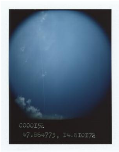
07_Dippoldsau | 0000152 | 47.864733, 14.610172 (EX) from The Blue Skies Project. FP-100C peel-apart instant film