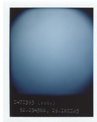
02_Auschwitz II - Birkenau | 1471595 (est.) | 50.034568, 19.181185 (EX) from The Blue Skies Project. FP-100C peel-apart instant film