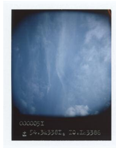
08_Kiel | 0000051 | 54.323381, 10.123386 (CO) from The Blue Skies Project. FP-100C peel-apart instant film