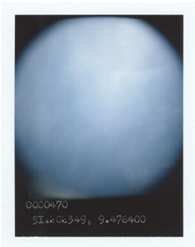
01_Breitenau | 0000470 | 51.202349, 9.476400 (EX) from The Blue Skies Project. FP-100C peel-apart instant film