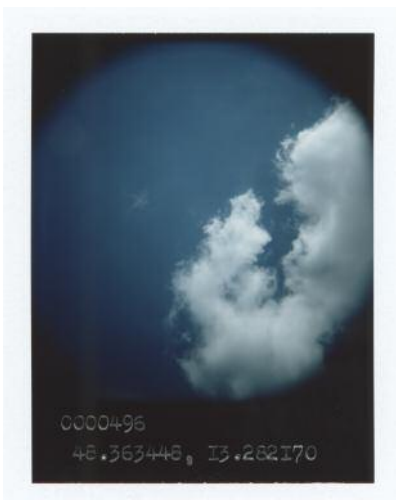
05_Kirchham bei Pocking | 0000496 | 48.363448, 13.282170 (EX) from The Blue Skies Project. FP-100C peel-apart instant film