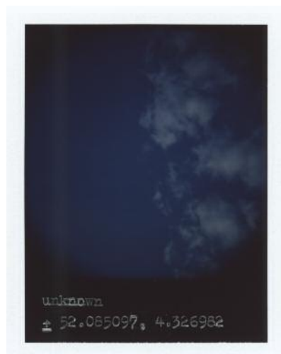
06_'s Gravenhage | unknown | 52.085097, 4.326982 (CO) from The Blue Skies Project. FP-100C peel-apart instant film