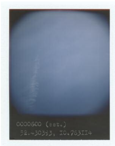
09_Fallersleben | 0000600 (est.) | 52.430393, 10.763114 (EX) from The Blue Skies Project. FP-100C peel-apart instant film