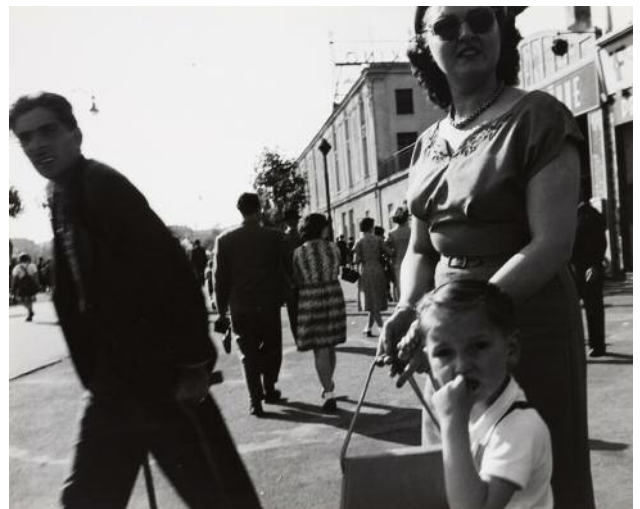
06 Leo Jahn-Dietrichstein, Im Prater , 1957