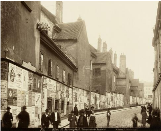
09_ August Stauda, In der Kaserngasse (today Otto-Bauer-Gasse) , c. 1902