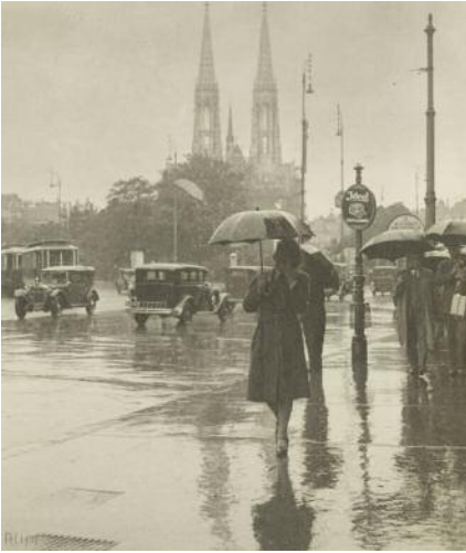
13_ Franz Holluber, Auf der Schottengasse , 1931