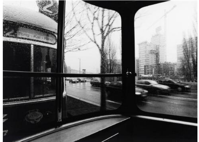
08_ Reinhard Mandl, Am Franz-Josefs-Kai , 2000 © Wien Museum