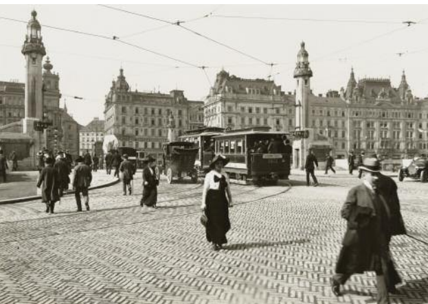
05 Unknown, An der Ferdinandsbrücke, Wien , c. 1911