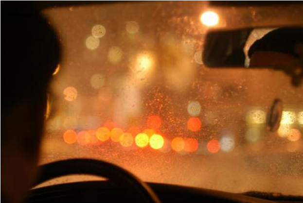
01 Harry Weber, Im Auto , from the series: Das Wien-Projekt , 2003–2007