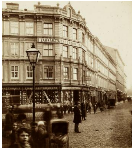
04 Michael Frankenstein & Comp, Blick in die Währinger Straße, Wien, c. 1880