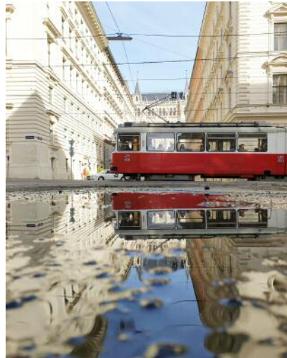
16_ @lukas_pellmann, Puddle Bim , 2020