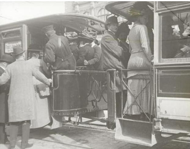
03 Emil Mayer, Auf der Straßenbahn, Wien , c. 1900