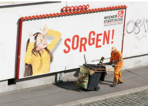
17_ @nelo_ruber, Clash of Generations , 2020