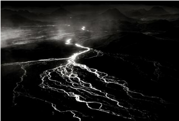
07_Glacier River, Highlands, Iceland, 2020