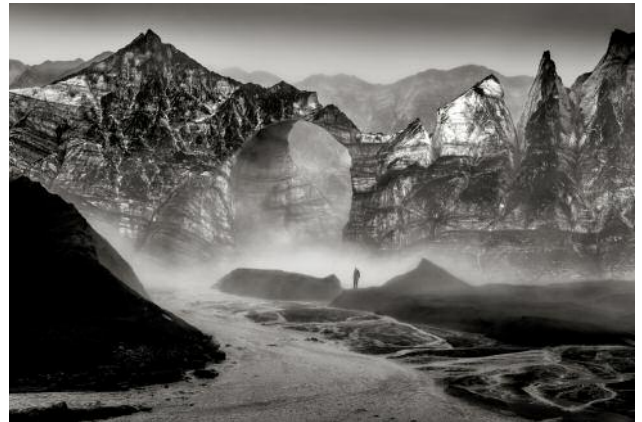
08_Kötlujökull Melting, Iceland, 2021