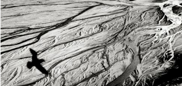
01_Mýrdalssandur, Iceland, 1996