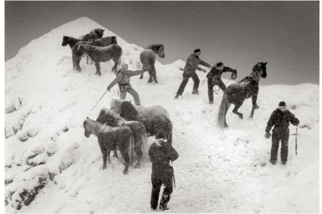
02_Horse Rescue, Skarðsheiði, Iceland, 199