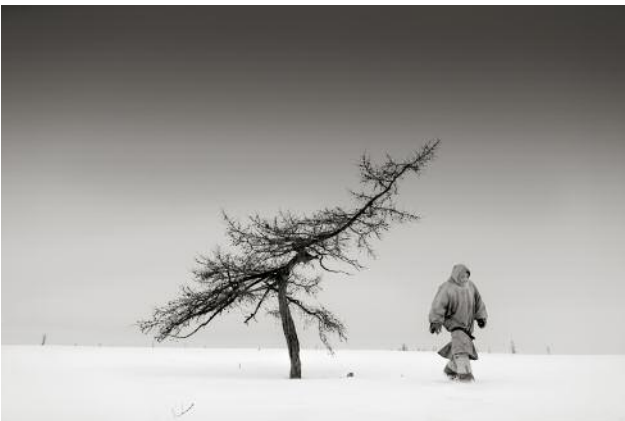
11_Aleksandr on the Tundra, Siberia, 2016