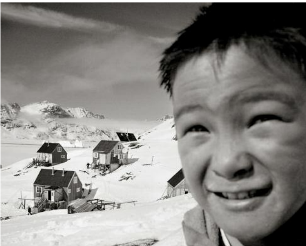
09_Sermiliqaaq, Greenland, 1997