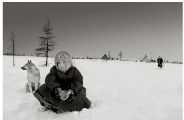
12_Nenet's Camp Side, Siberia, 2016