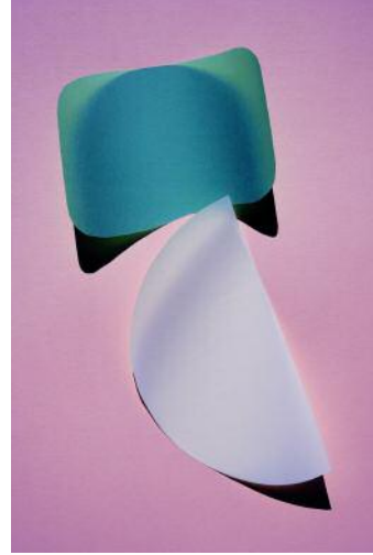
02 cut out 11 © Jessica Backhaus / VG Bild-Kunst, Bonn