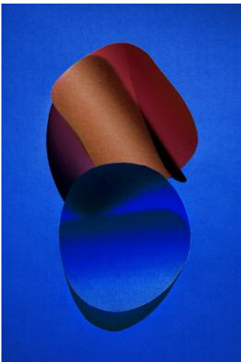
09 cut out 26