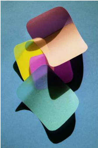
01 cut out 6