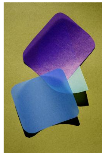
06 cut out 20 © Jessica Backhaus / VG Bild-Kunst, Bonn