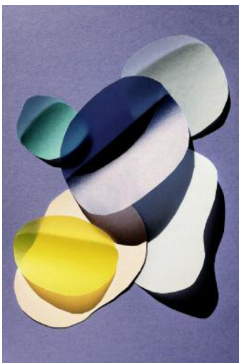
05 cut out 16