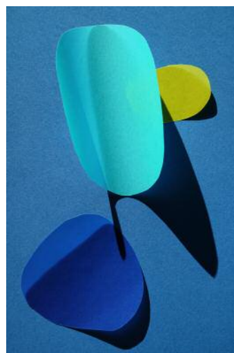
12 cut out 44