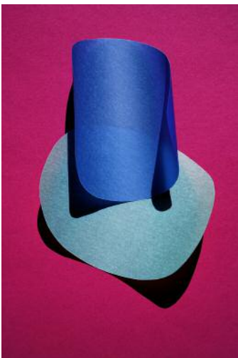
03 cut out 12