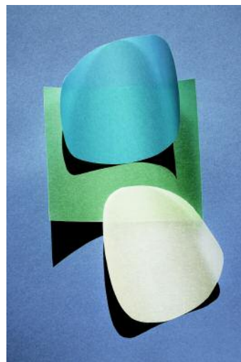
10 cut out 35 © Jessica Backhaus / VG Bild-Kunst, Bonn