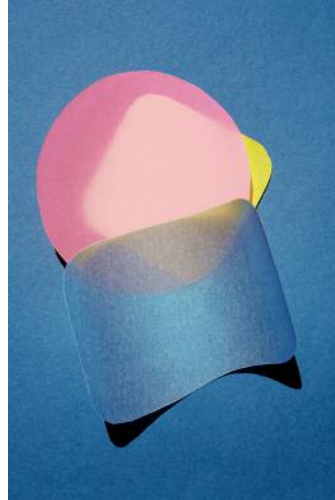
08 cut out 25