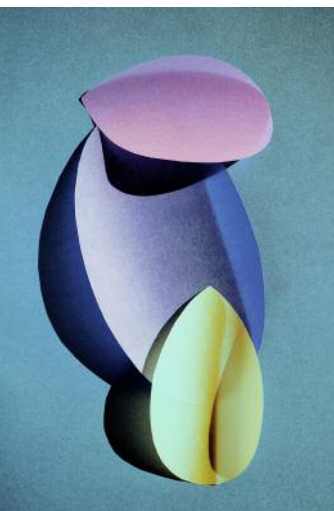
11 cut out 40