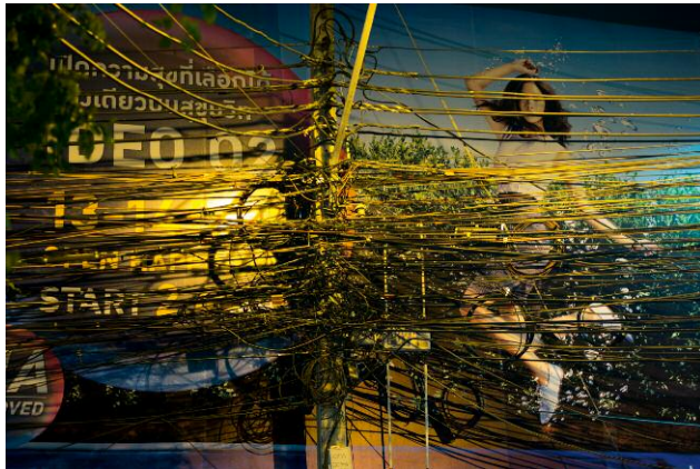
02 Girl with Cables