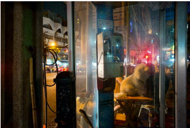
07 Poodle, Nana © Frank Hallam Day