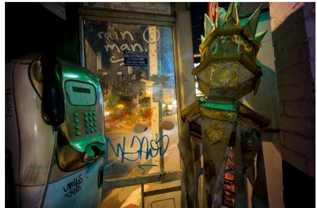
08 Rain Man © Frank Hallam Day