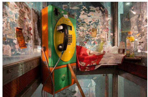
10 Yellow Bottle