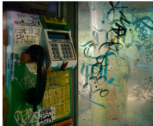
03 Life is Pain