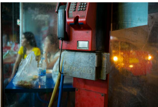
09 Yellow Shirt, Blue Table