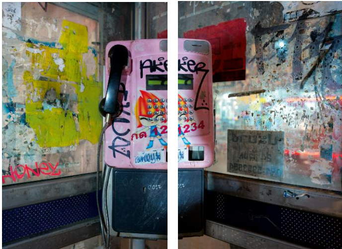
06 Pink Aker (diptych)