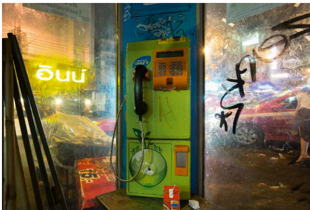
04 Red Milk Carton