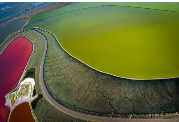
05_From Sky to Salt Aerial XII, 2015 @Barbara Boissevain