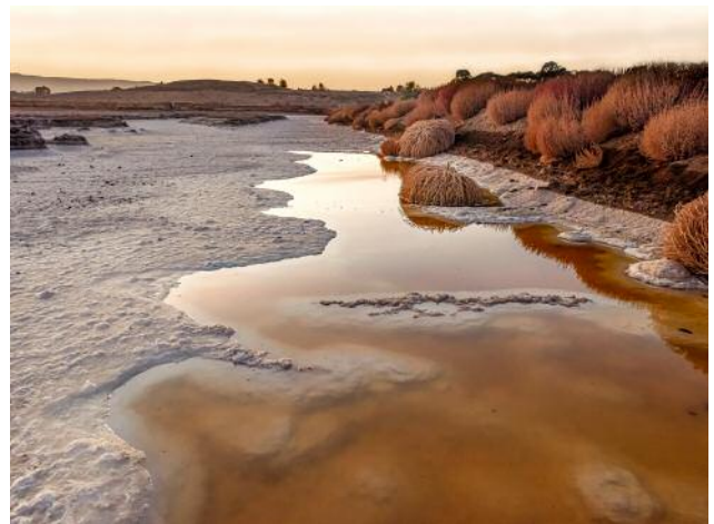
10_Ravenswood XIII, 2021 @Barbara Boissevain