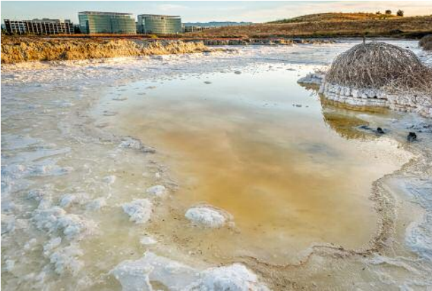
01_Ravenswood VI, 2020