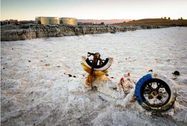
07_Ravenswood Ponds Looking Towards Meta & Tricycle, 2020