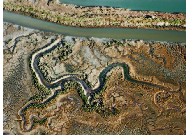
08_Tidal Salt Marsh (Aerial), 2015