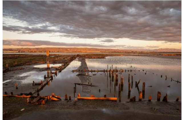
02_Ruins of Historical Salt Production Site I, 2023