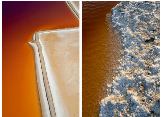
06_Macro/Micro Diptych I, 2021