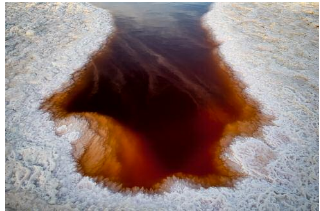
04_Ravenswood III, 2022