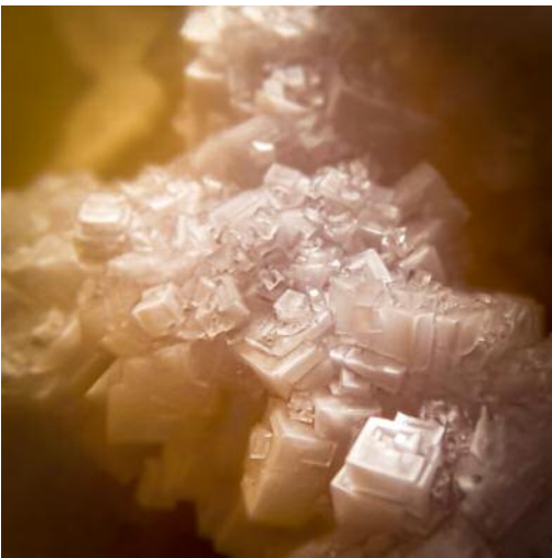
09_Alien Saltscapes IX, 2022