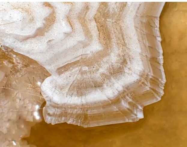
11_Alien Saltscapes XI, 2022