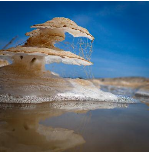
03_Alien Saltscape III, 2022