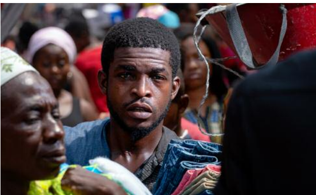
11 LAGOS