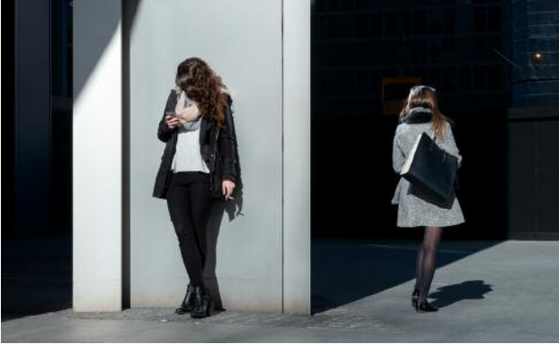
07 LONDON