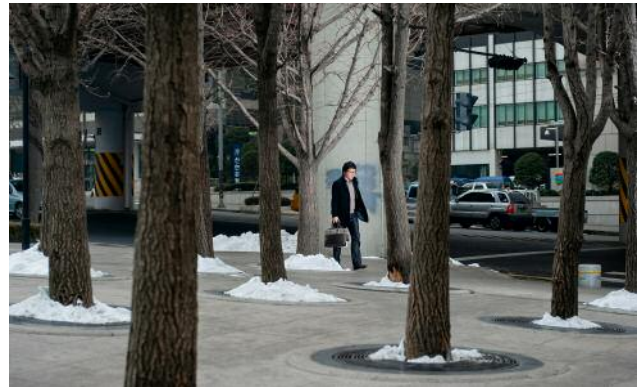
10 SEOUL © Bas Losekoot