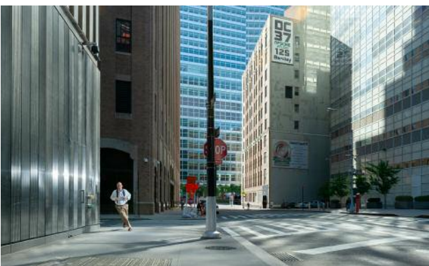
05 NEW YORK