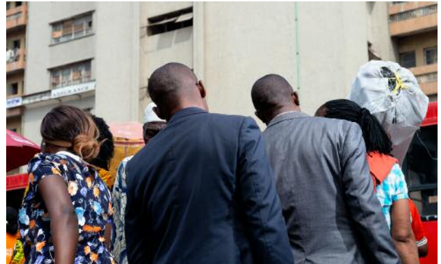
02 LAGOS