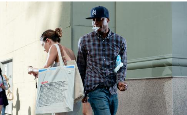
03 NEW YORK © Bas Losekoot