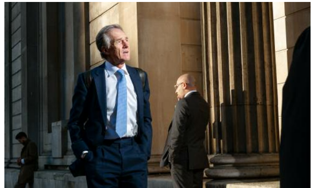
08 LÖNDON