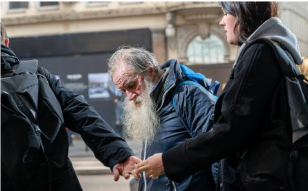
09 LONDON