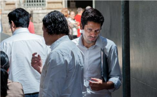
01 SÃO PAULO