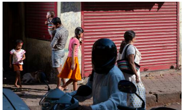
12 MUMBAI