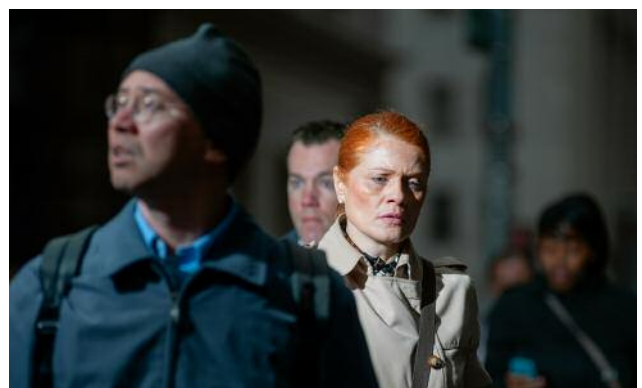
06 NEW YORK