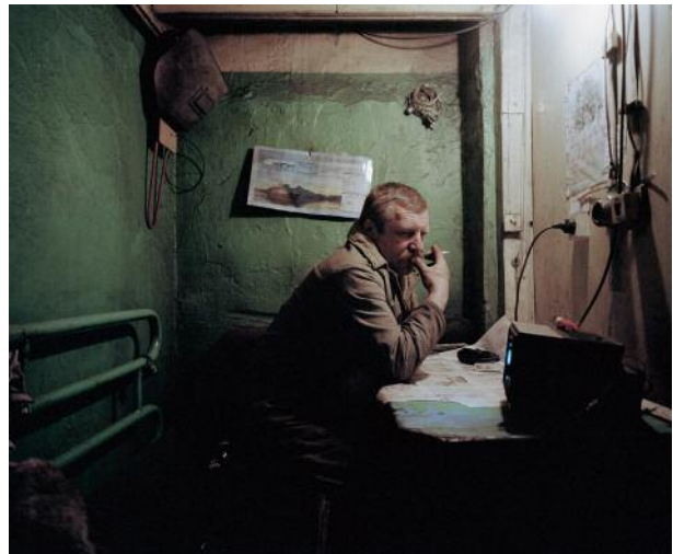
4 Vladimir Vladimirovich, Teriberka