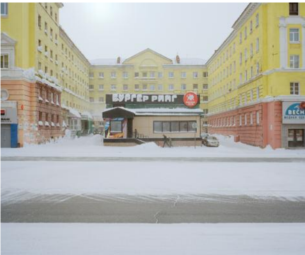
11 Burger Ring, Norilsk