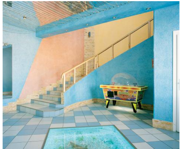
10 Fish Shop, Norilsk