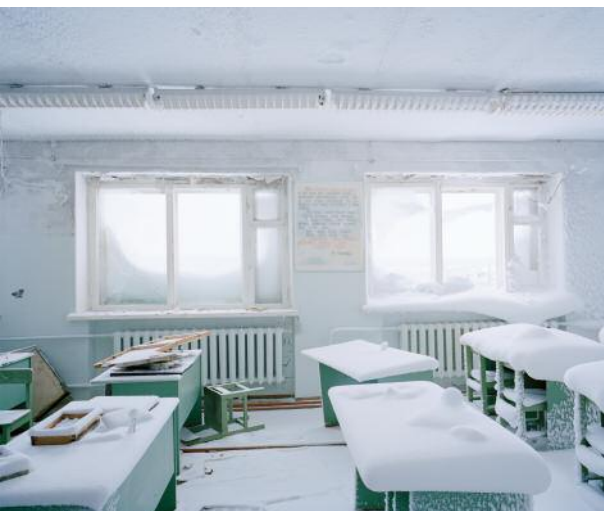
5 School, Dikson