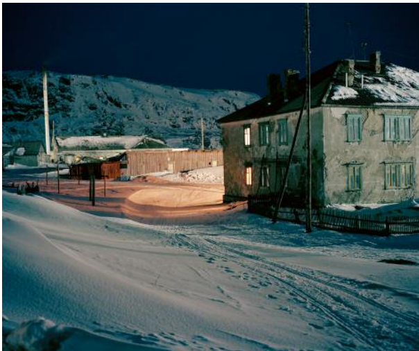
3 Boiler, Teriberka