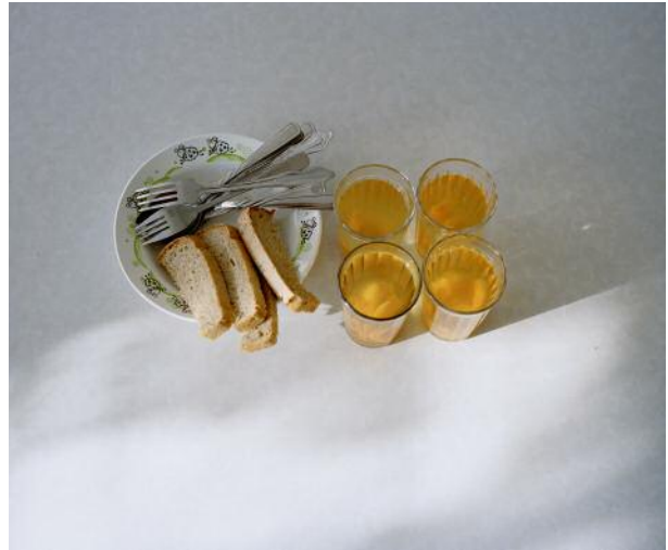
2 Compote, Teriberka