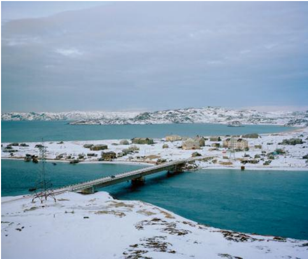
1 Teriberka