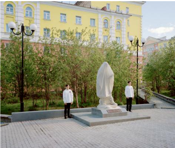
9 Nikolay Nikolayevich Urvantsev, Norilsk