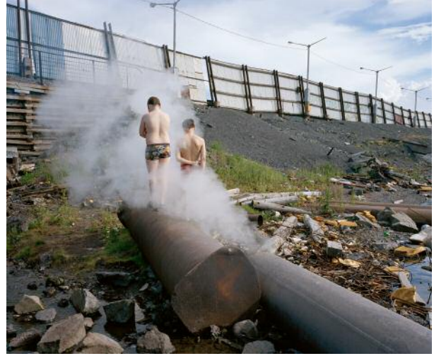
8 Heating, Norilsk