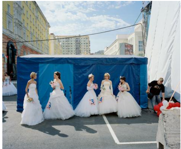
12 Brides, Norilsk © Beat Schweizer