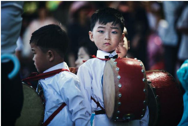
3 © Xiomara Bender