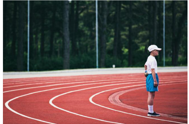
4 © Xiomara Bender