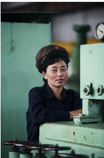
5 © Xiomara Bender