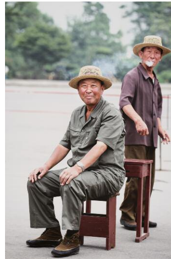
6 © Xiomara Bender