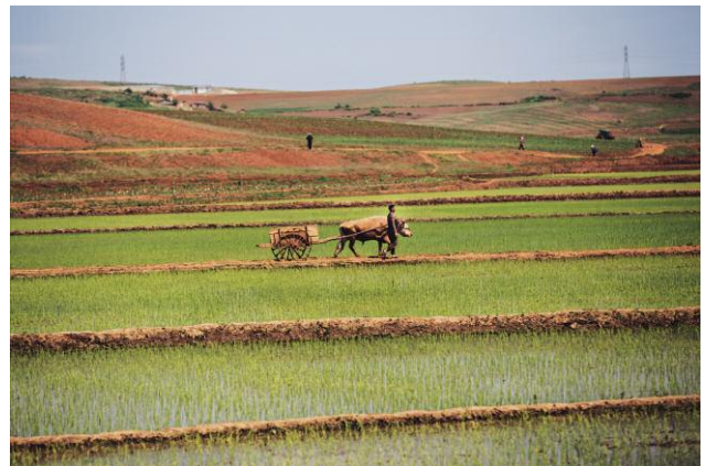
10 © Xiomara Bender