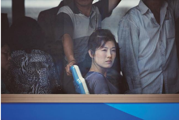
1 © Xiomara Bender