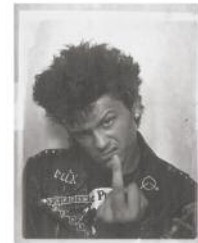
2 © Ada Bligaard Søby