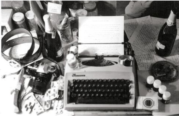
9 © Ada Bligaard Søby