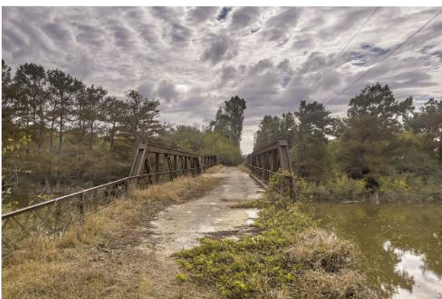
11_Black Bayou Bridge, Glendora, Mississippi, 2021