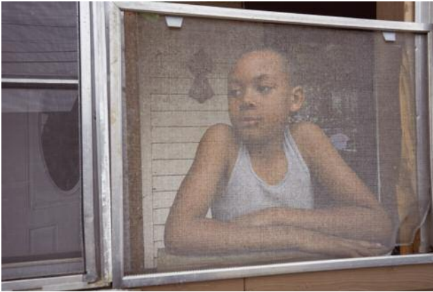
01_Sunday morning, Vicksburg, Mississippi, 2018