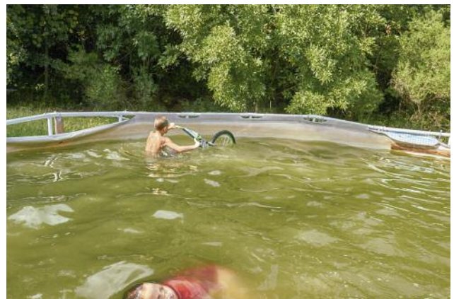
04_Afternoon bike ride, Crowder, Mississippi, 2016