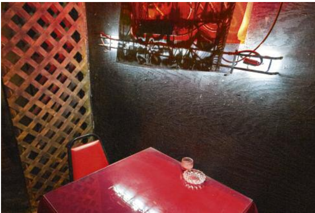
07_Table for one at Wee Jay's, Clarksdale, Mississippi, 2014