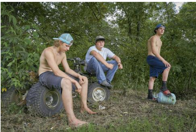
03_Friends, Crowder, Mississippi, 2016