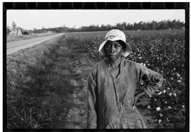
12_Cotton picker, Pulaski County, Arkansas, 1935 (archival photo)