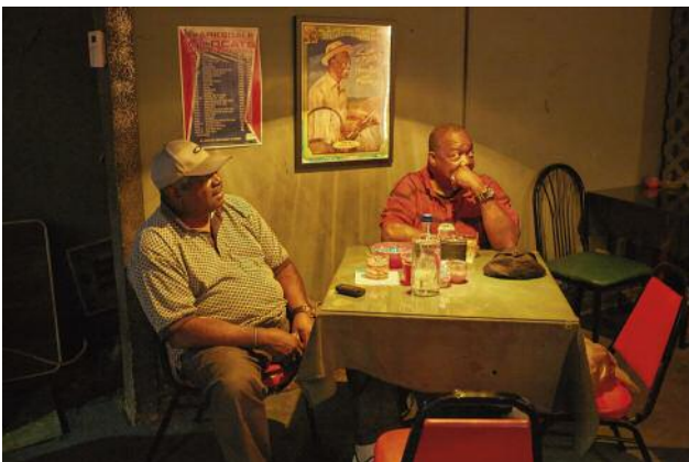
09_House party at Wee Jay's, Clarksdale, Mississippi, 2014