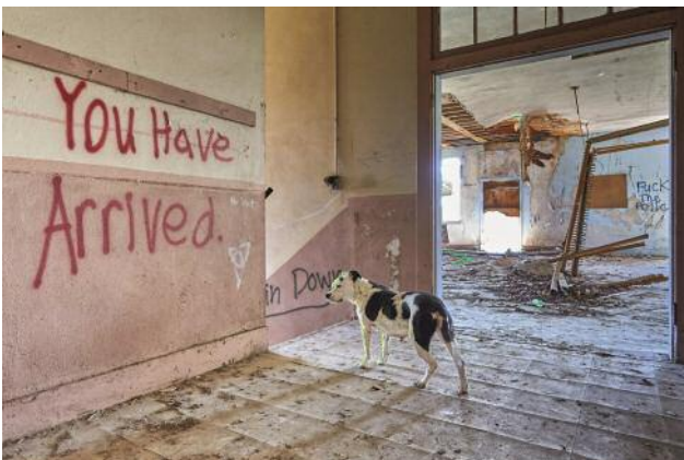
05_You have arrived, Bolton, Mississippi, 2018