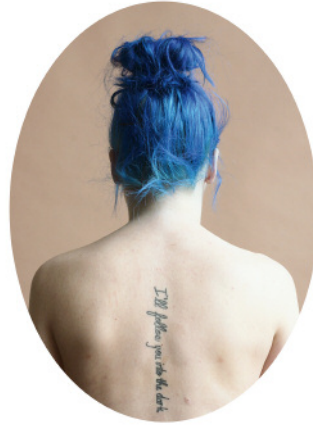
6. Sinead