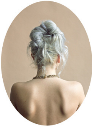
1. Devon © Tara Bogart