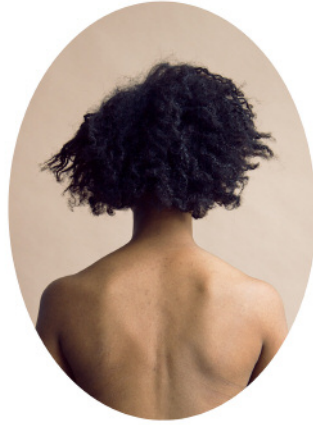
4. Saige