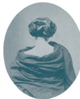
Nadar, Marie Laurent (1865)