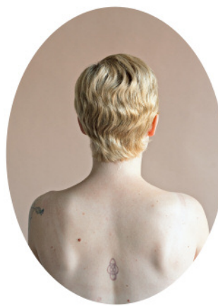
12. Jessie © Tara Bogart