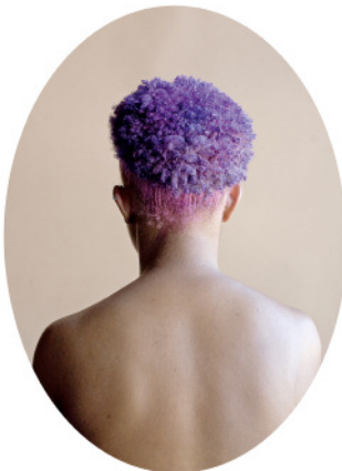
9. Alexis