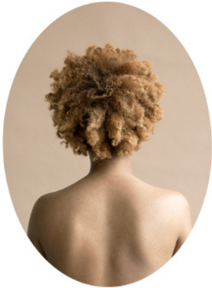
7. Jasmine © Tara Bogart