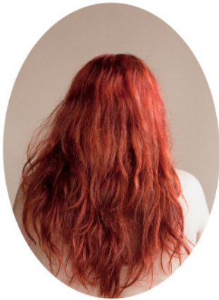
3. Clemence © Tara Bogart