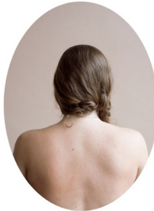
10. Lauren