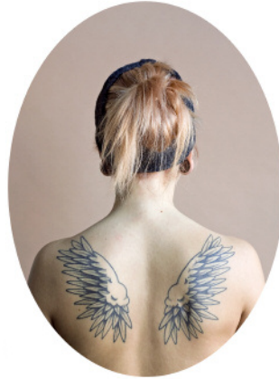
8. Kathryn © Tara Bogart