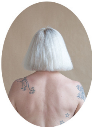
5. Zoe