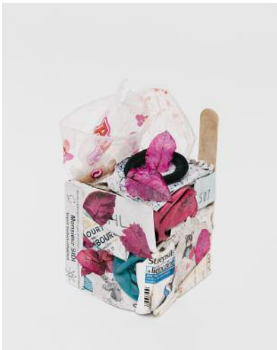
03_Maternité Grande-Duchesse Charlotte