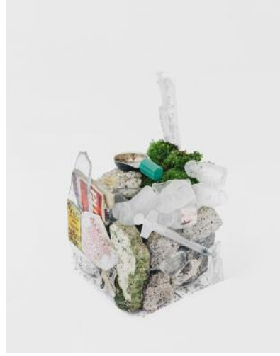
08_Abandoned House © Boris Loder