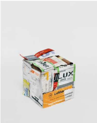
01_Aéroport de Luxembourg