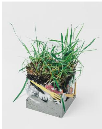
06_Sports Ground Campus Geesseknäppchen