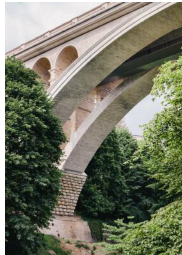
10 Pont Adolphe (Landscape) © Boris Loder