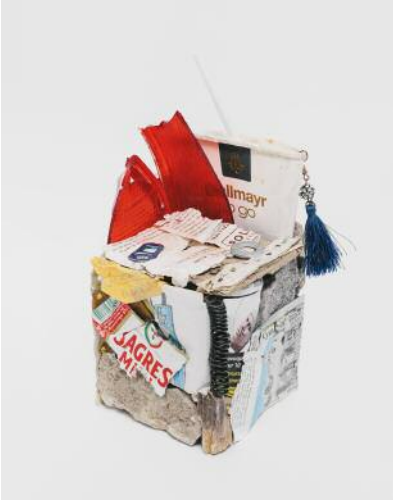
07_Lycée Technique du Centre © Boris Loder