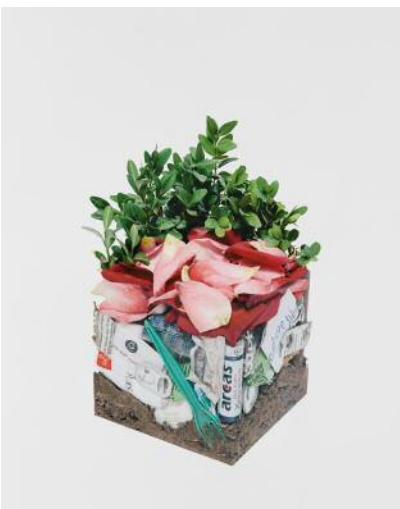
05_Place des Martyrs