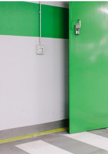
09_Aéroport de Luxembourg (Landscape)