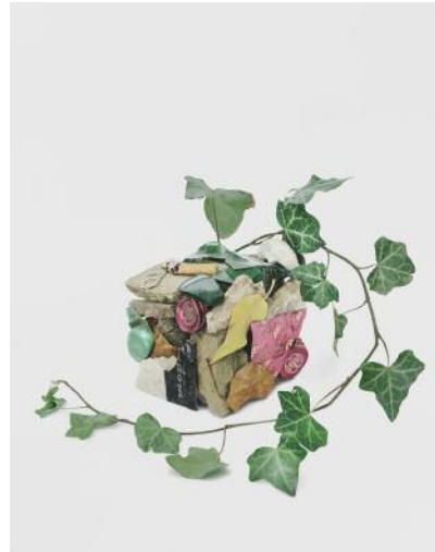
02_Eglise Saints Pierre et Paul