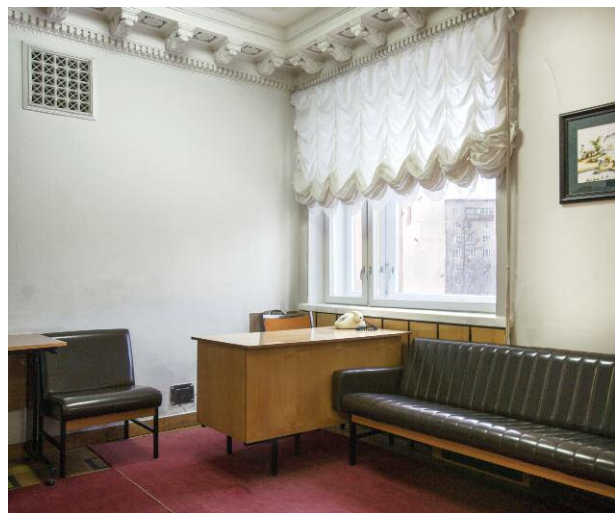
12_Executive Committee Meetings Hall, Federation of Independent Trade Unions of Russia fnpr | moscow, russia