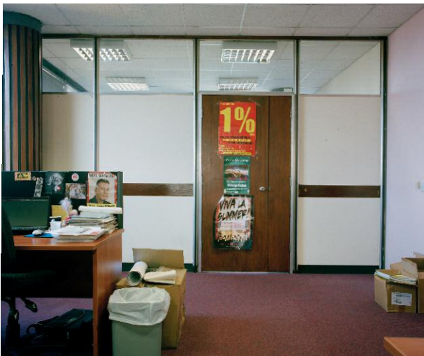
03_Services, Industrial Professional & Technical Union siptu | dublin, ireland