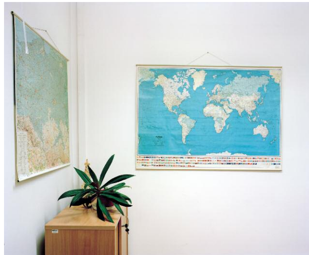
10_Solidarnosc – Independent Self-governing Trade Union gdansk, poland