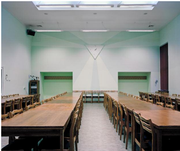
09_All-Poland Alliance of Trade Unions opzz | warsaw, poland