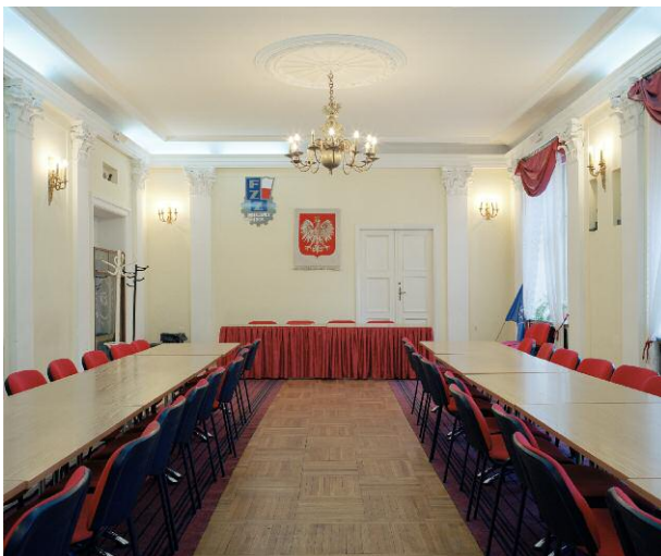
05_Trade Unions Forum, Poland fzz | warsaw, poland