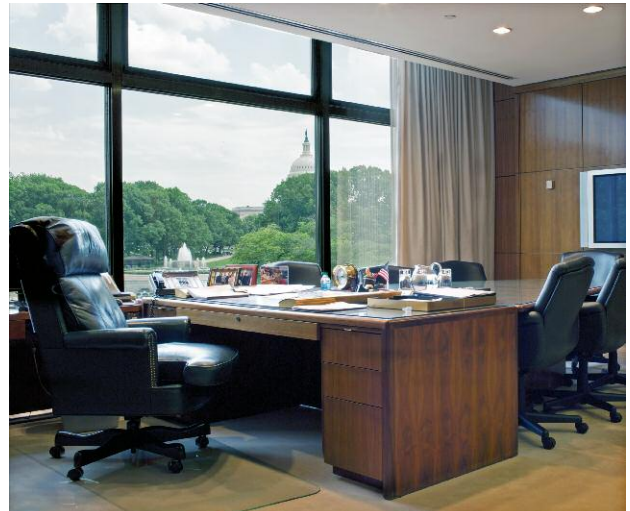
06_Office of the General President, James P. Hoffa - International Brotherhood of the Teamsters, ibt | washington, d.c., usa