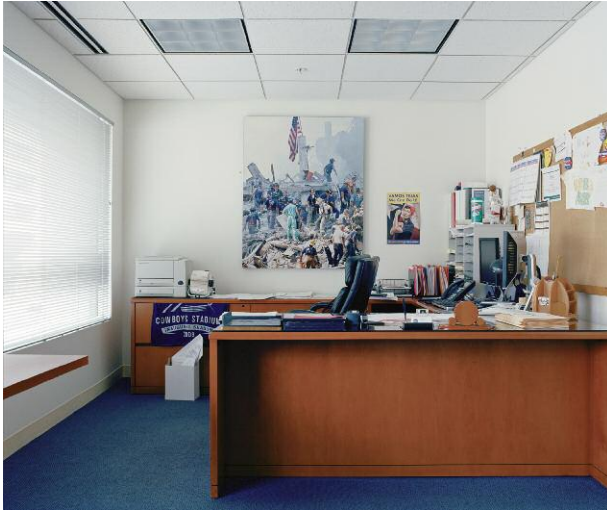
01_Maritime Trades Department AFL-CIO Building afl-cio | washington, d.c., usa