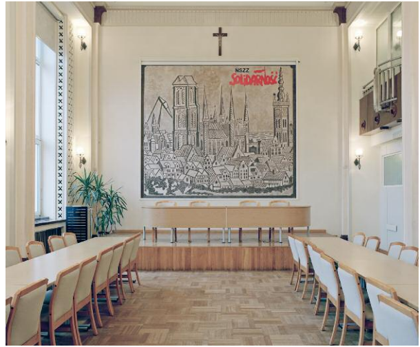
08_Solidarnosc – Independent Self-governing Labour Union gdansk, poland