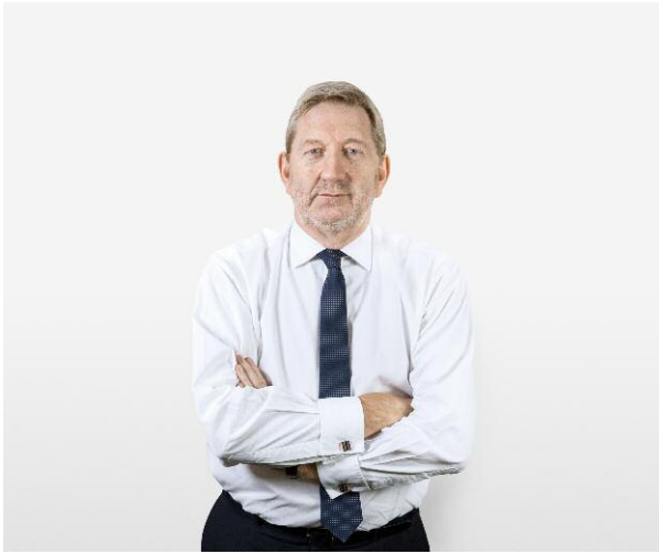
07_General Secretary, Len McClusky, Unite the Union unite | london, uk