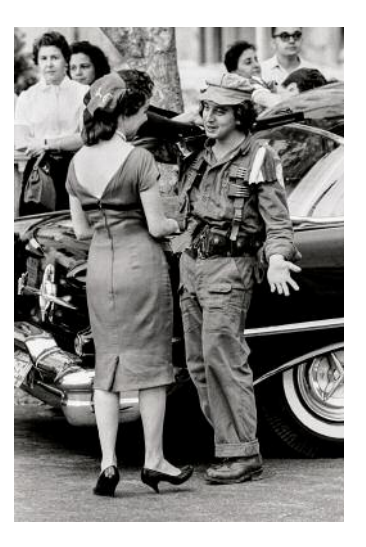
o8 A young guerilla speaks to a civilian woman during the Cuban Revolution. Havana, Cuba. 1959.