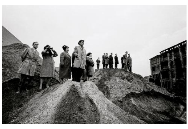
10 While the Berlin Wall is still low enough to see over, residents of West Berlin look to East Berlin. Germany. 1961.