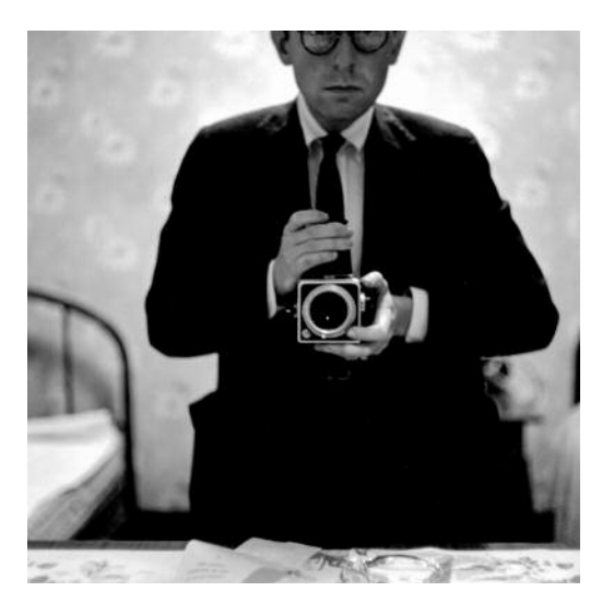
13 Self-portrait by Burt Glinn. USA. 1954.