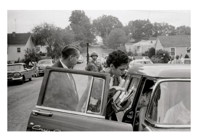
og With U.S. Army troops standing guard, members of the Little Rock Nine head to Little Rock Central High School during the school's integration. Little Rock, Arkansas, USA. 1957.