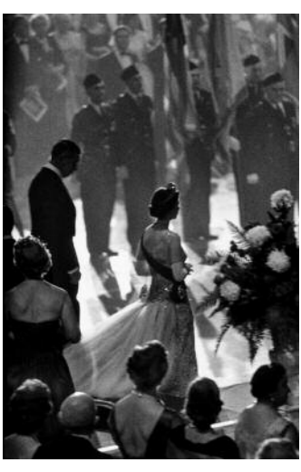
o3 Queen Elizabeth II visits America. New York City, New York, USA. 1957.