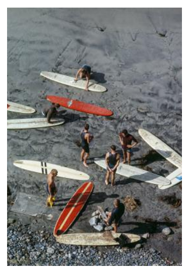
11 Surfers on the beach. Malibu, California, USA. 1965.