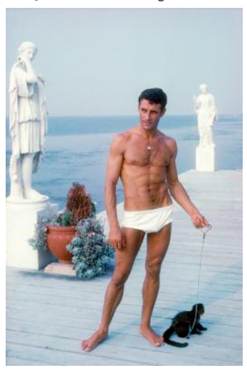
o6 Cherry Grove. Fire Island, New York, USA. 1961.