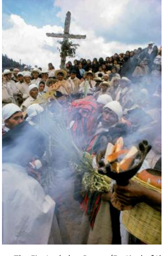
o4 The Fiesta de las Cruces (Festival of the Crosses) is celebrated in San Juan Chamula, the principal town of the Indigenous Tzotzil people. Chiapas, Mexico. 1962.