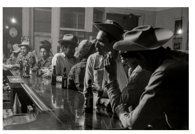
12 A bar on the Fort Peck Reservation. Poplar, Montana, USA. 1954.