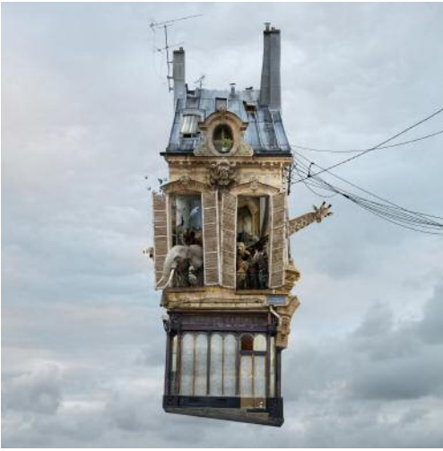
7 STILL LIFE / Nature Morte © Laurent Chéhère