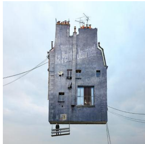
2 THE PETIT JOURNAL / Le Petit Journal © Laurent Chéhère