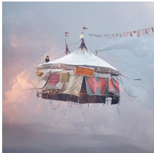
4 THE CIRCUS/ Le Cirque © Laurent Chéhère