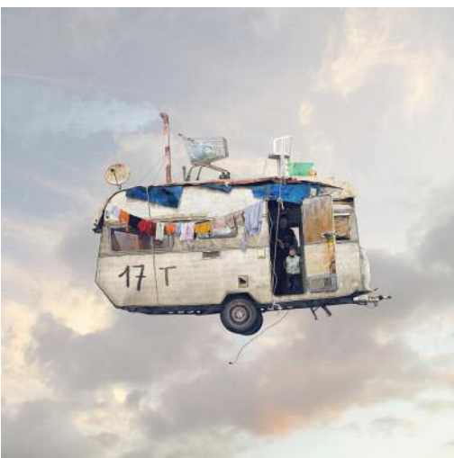
5 THE CARAVAN / La Caravane © Laurent Chéhère