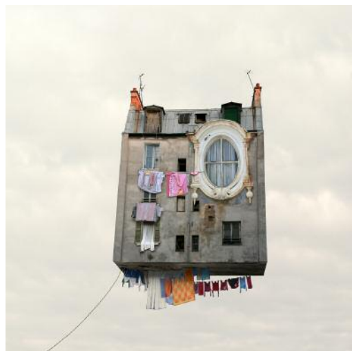
6 THE LOWER DEPTHS / Les Bas-fonds © Laurent Chéhère