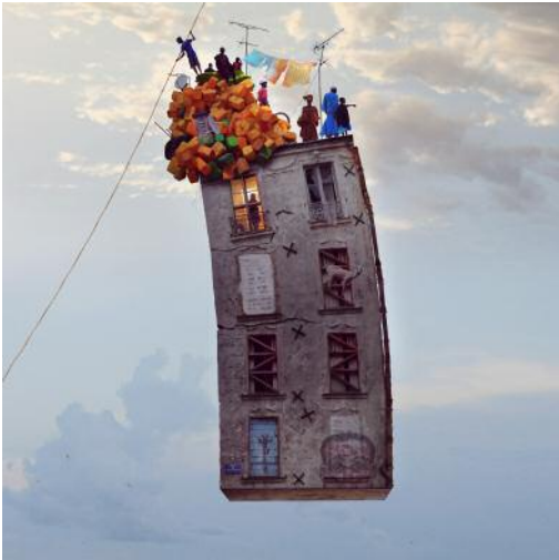
1 THE GRAND ILLUSION / La Grande Illusion © Laurent Chéhère