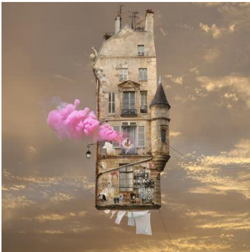
9 PINK / Rose © Laurent Chéhère