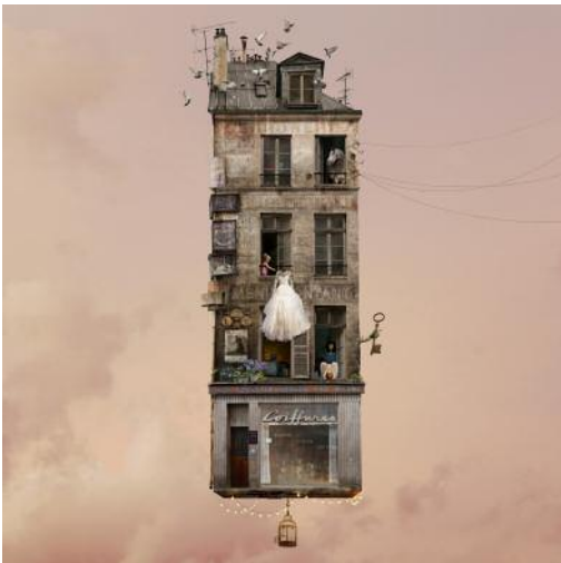
3 A SPECIAL DAY / Le Grand Jour © Laurent Chéhère