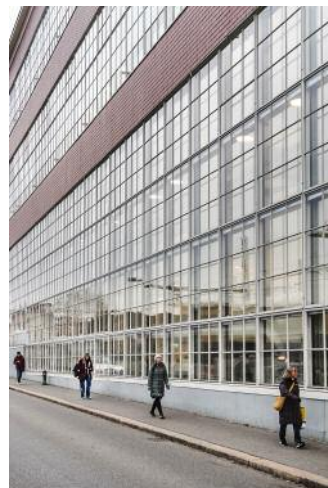
12_Sulzer-Areal, Winterthur (Stadtmensch), 2021