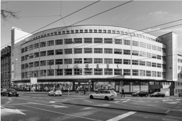
07_Suva-Haus (1931), Bern (Bauten der Moderne), 2014