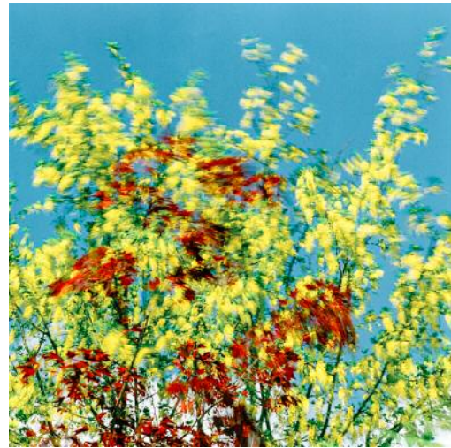
02_Leissigen (Makan), 2001 © Christian Helmle