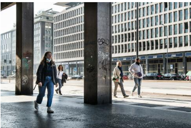
11_Stazione Centrale, Mailand (Stadtmensch), 2021