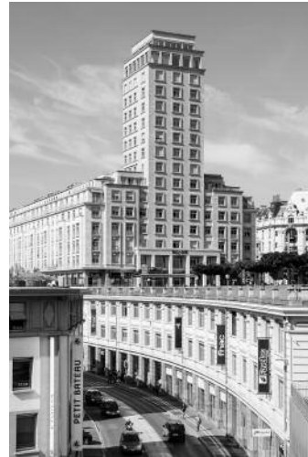
08_Tour Bel-Air (1932), Lausanne (Bauten der Moderne), 2017