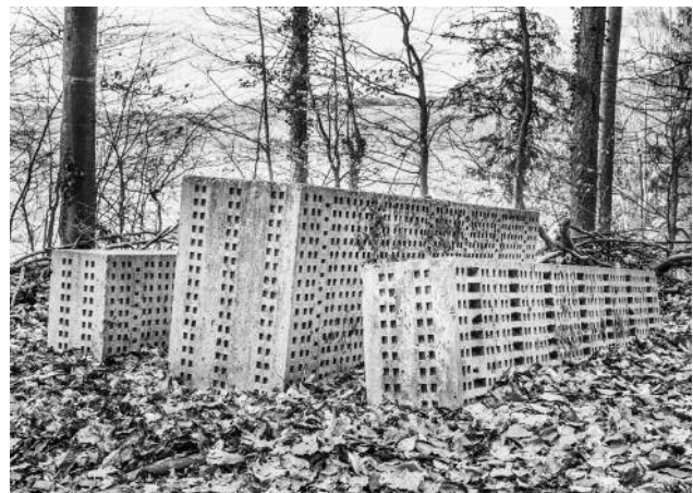
06_Belpberg, 2021 © Christian Helmle