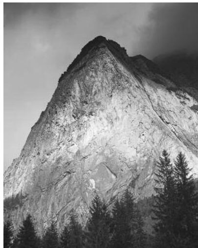
04_Mittagsfluh, 2008