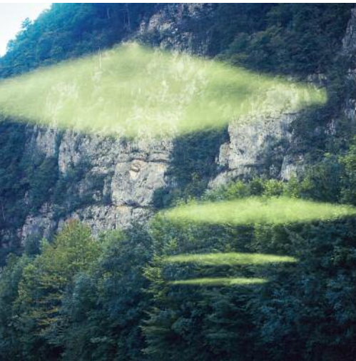
03_Heimwehfluh (Makan), 2000 © Christian Helmle