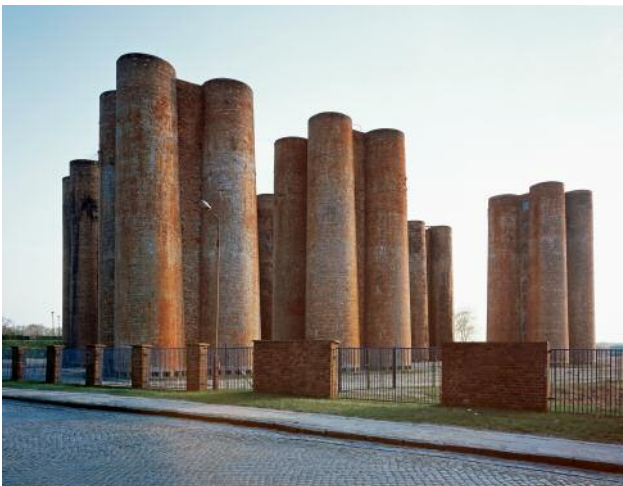
09_Biotürme (Weisse Elefanten), Lauchhammer (D), 2005