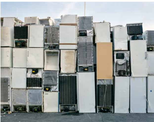
05_Kleine Allmend, 2005