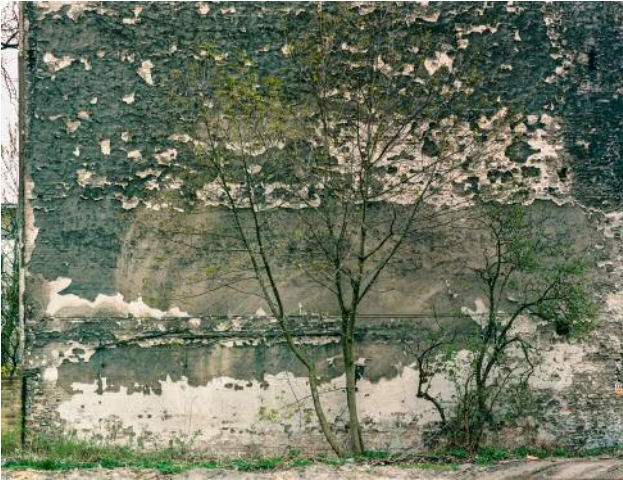
01_Stralau, 2005