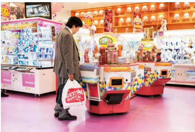
3_Gambling hall in Shibuya, Tokyo: the bright and colorful gambling halls are a common passtime.