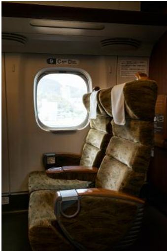
1_Seventies-style seating interior in a Shinkansen.