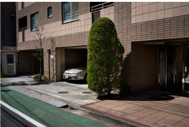
9_Luxury residential building in Shirokane, Tokyo.