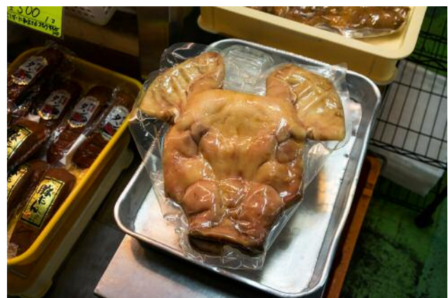
12_Vacuum-packed pig head on a market in Naha, Okinawa.