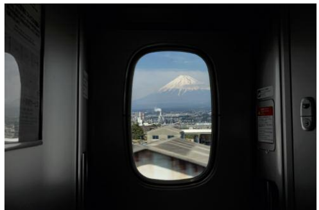
6_Train ride in the Shinkansen from Mishima to Shizuoka.