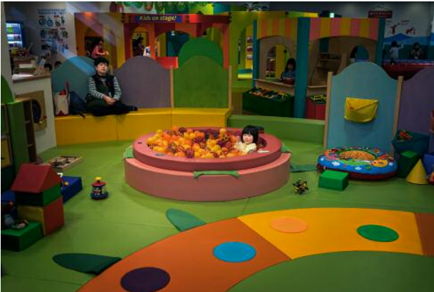
7_Childcare in a shopping mall in Hiroshima.