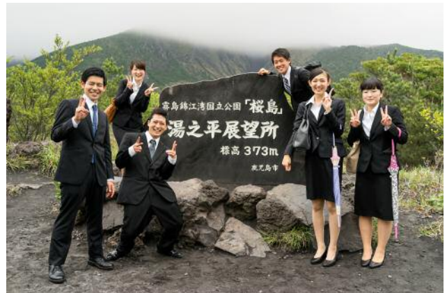
2_Lookout point on the volcanic island of Sakurajima.