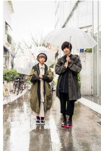
8_Omotesando street in Tokyo. The district is well-known for trendy fashion outlets and demanding architecture.