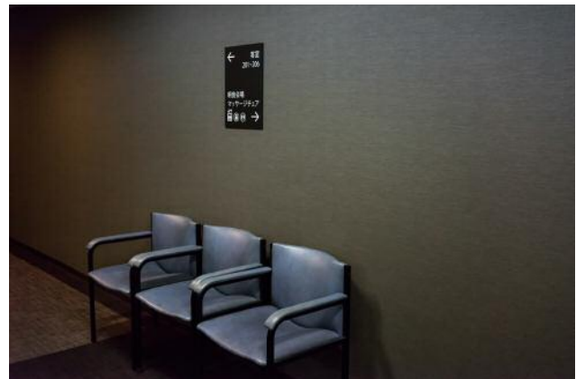
10_Happy Hotel, Seta.