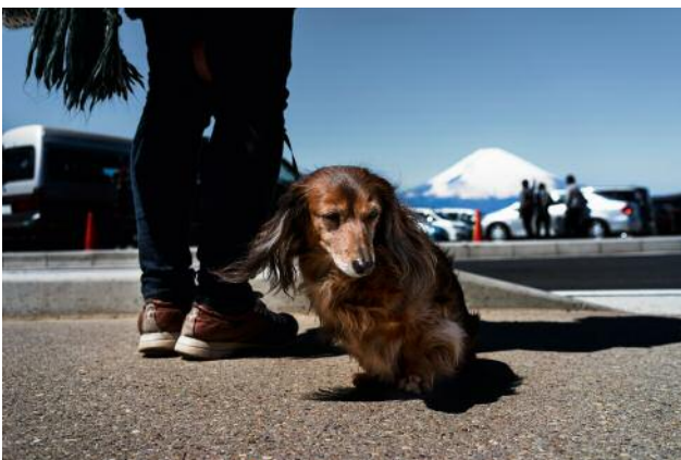
5_Excursionist with her dog on a parking lot not far from the Fuji.