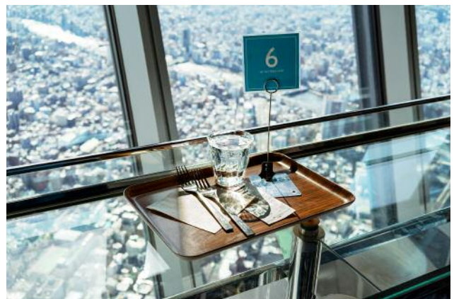
4_View from the 350 m high Skytree Restaurant in Tokio. The TV tower is the highest accessible spot in Tokyo.