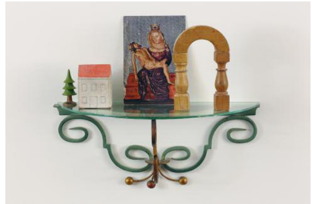
10_La Pietà Venerata © Stephen Cone Weeks