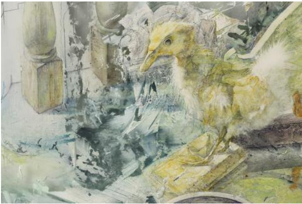
1_the place you can't get to (detail) © Stephen Cone Weeks