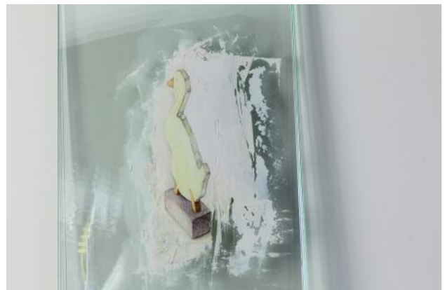
4_das Holzspielzeug © Stephen Cone Weeks