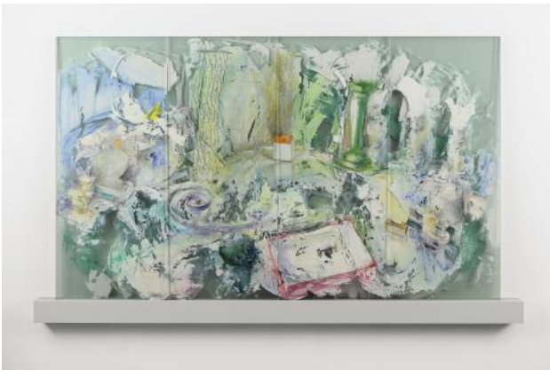
9_unruhig ist unser Herz