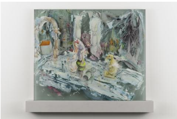
5_going home