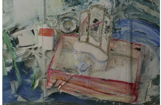
8_was uns trägt (detail) © Stephen Cone Weeks