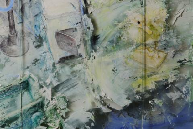
7_was uns trägt (detail) © Stephen Cone Weeks