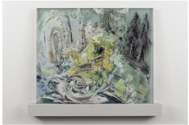
2_the place you can't get to © Stephen Cone Weeks