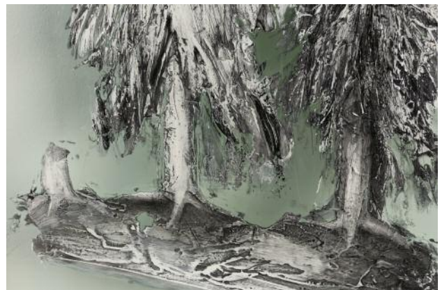
6_der Wald