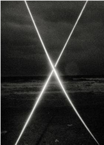
01 © Daniel Tchetchik