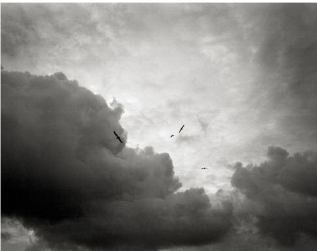
05 © Daniel Tchetchik