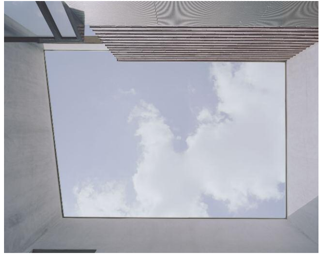
Press image 8 from the series »Bellevue Hospital«