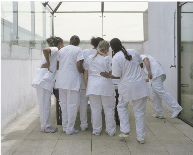
Press image 9 from the series »Bellevue Hospital«