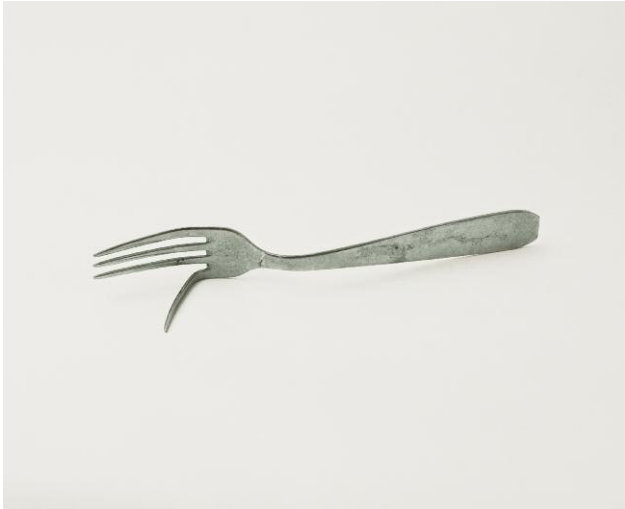
Press image 1 from the series »Objects and Constraints«