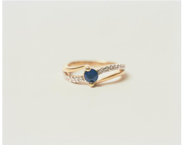
Press image 2 from the series »Objects and Constraints«