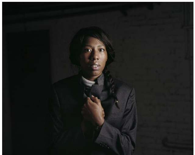
Press image 4 from the series »Psychadascalia«