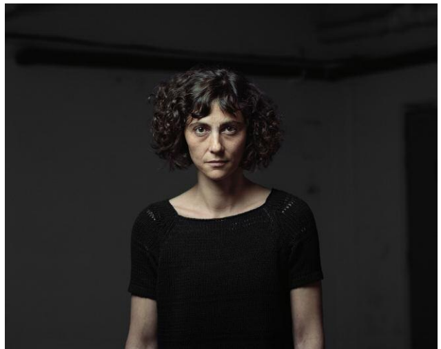
Press image 6 from the series »Psychadascalia«