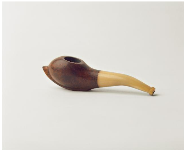
Press image 3 from the series »Objects and Constraints« © Jean-Robert Dantou / Agence VU'