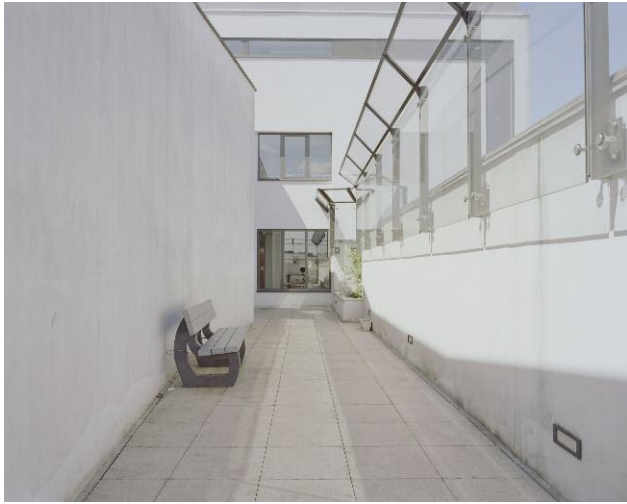
Press image 7 from the series »Bellevue Hospital«