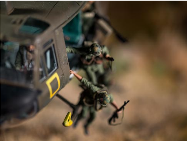
01 © David Levinthal