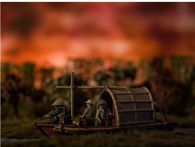
05 © David Levinthal