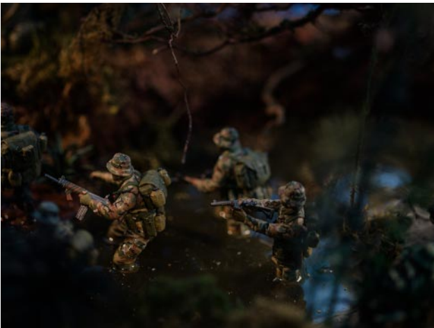
03 © David Levinthal