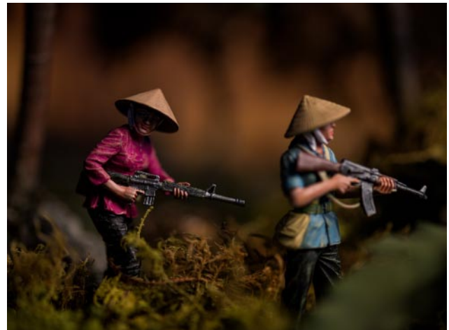
04 © David Levinthal