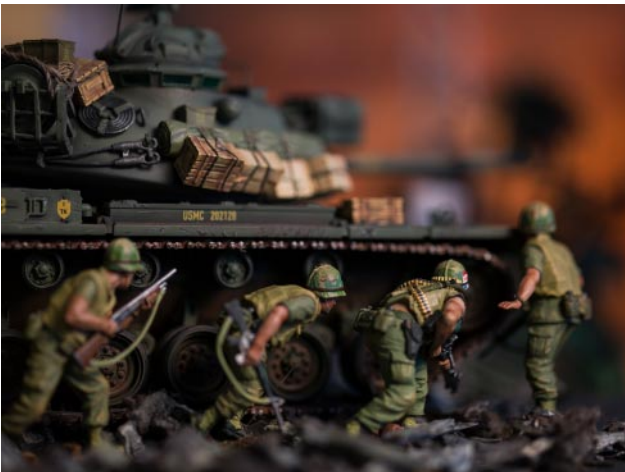
09 © David Levinthal