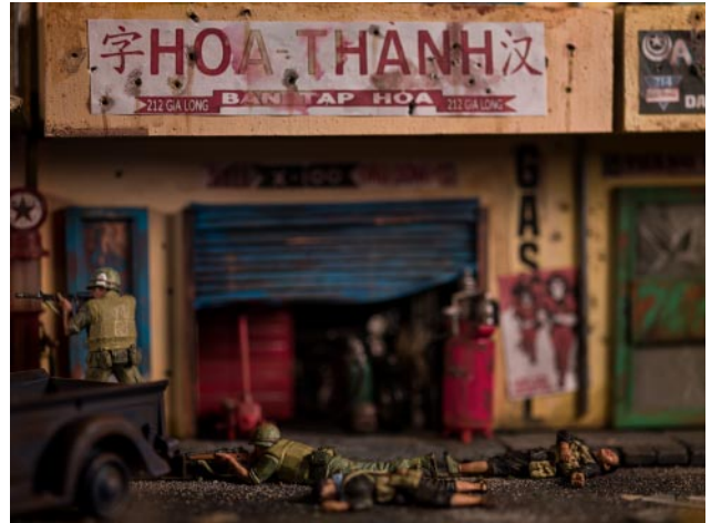
08 © David Levinthal