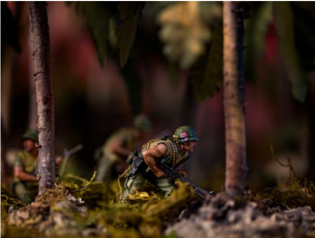
07 © David Levinthal