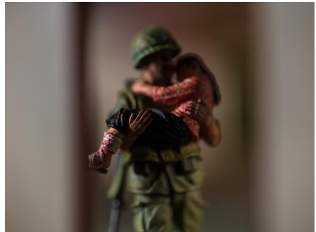
10 © David Levinthal