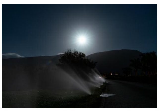
12_Sprinklers in the Moonlight, 2020