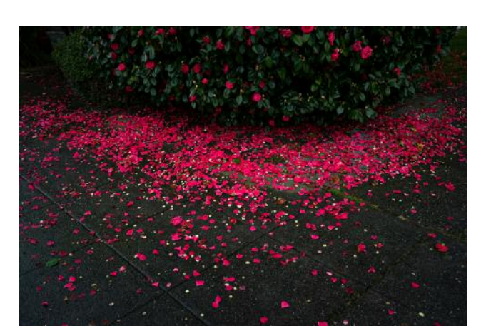
07_Sidewalk Petals, 2021