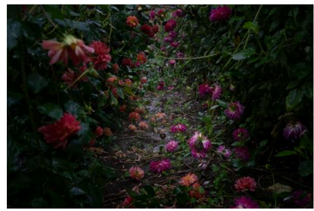
02_ Fallen Dahlias, 2020 © Deb Achak