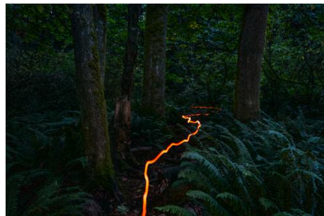
04_A Walk in the Woods, 2018 © Deb Achak