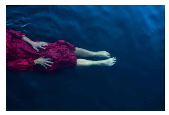
01_TheRed Dress, 2019 © Deb Achak