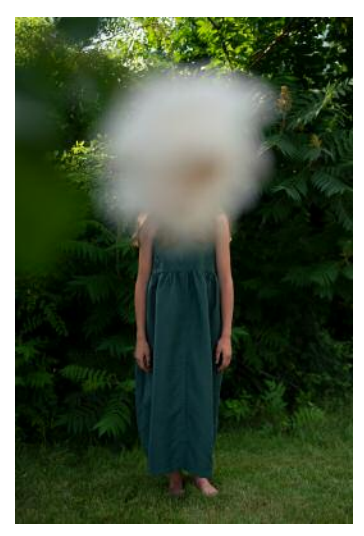
09_Wild Rose, 2022 © Deb Achak