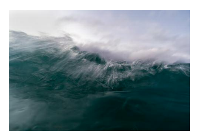
11_Wave Breaking, 2020