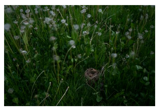
10_Fallen Nest in the Dandelions, 2021