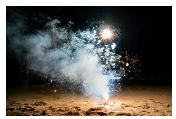
05_New Year, 2020