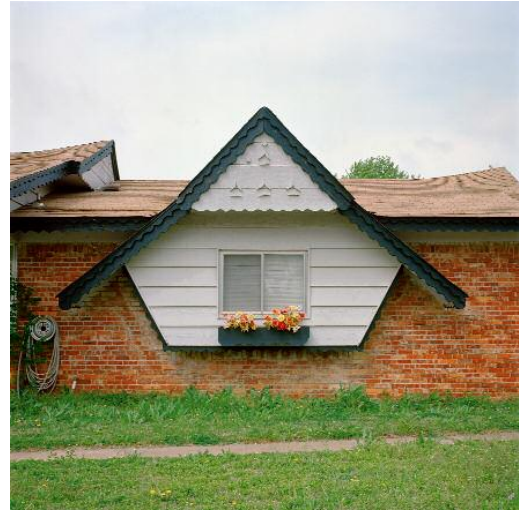
02_Del City, Oklahoma