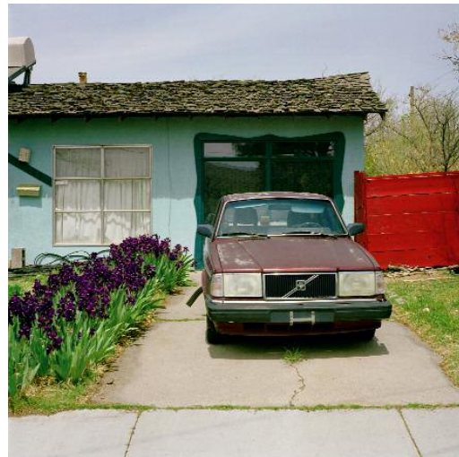
10_Princess Jeanne addition, Albuquerque, New Mexico