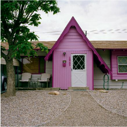
01_Princess Jeanne addition, Albuquerque, New Mexico