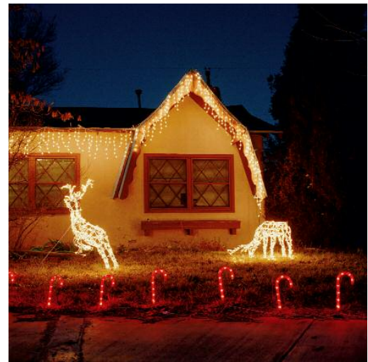
04_Princess Jeanne addition, Albuquerque, New Mexico