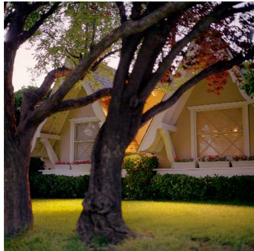
06_Bellehaven, Albuquerque, New Mexico ©KayLynn Deveney