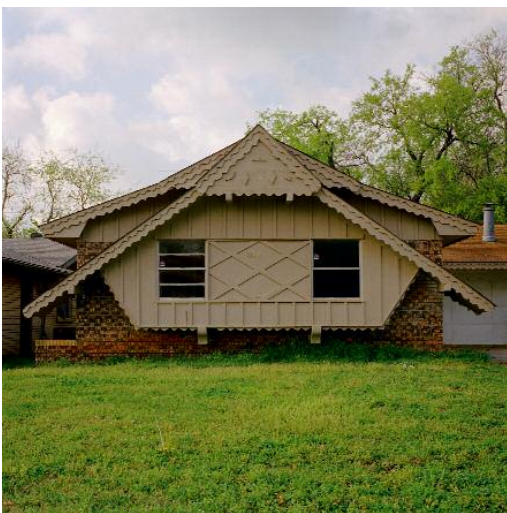
11_Del City, Oklahoma