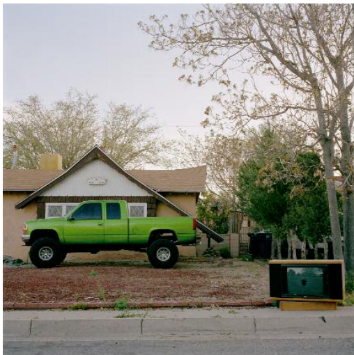
03_Princess Jeanne addition, Albuquerque, New Mexico