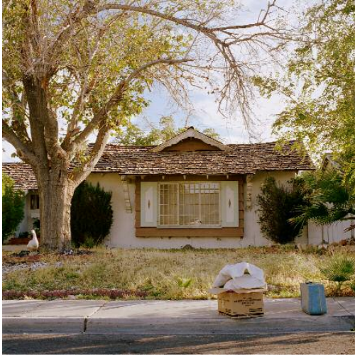
07_Las Vegas, Nevada