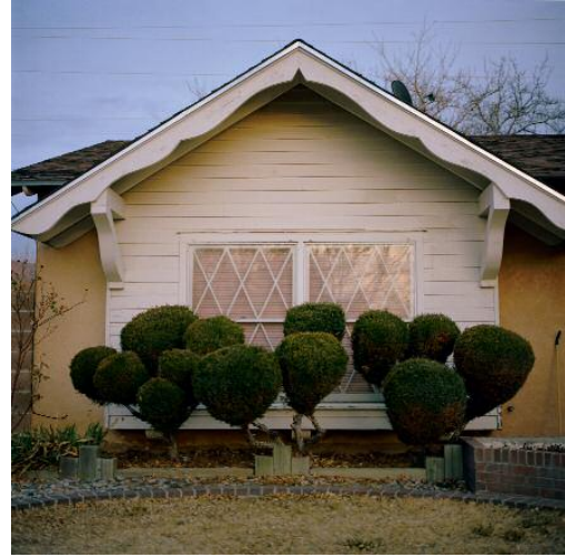
08_Bellehaven, Albuquerque, New Mexico