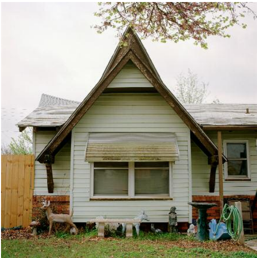
09_Del City, Oklahoma