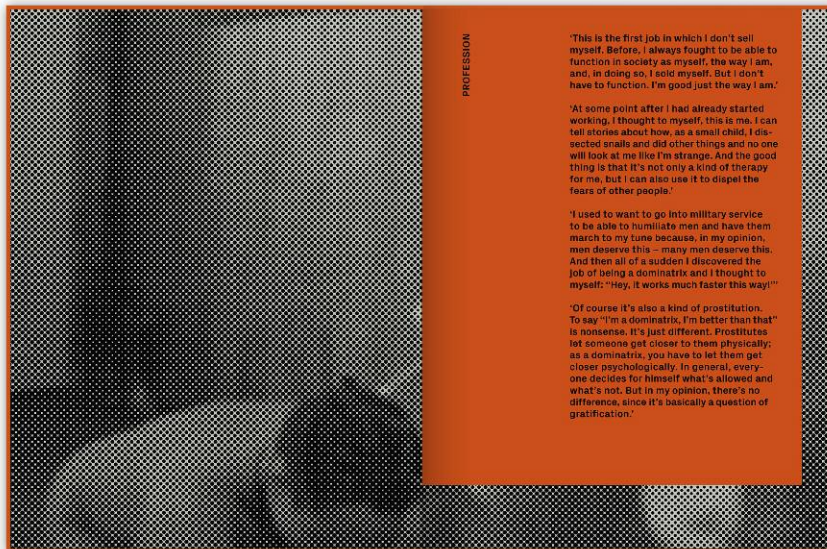
9 Spread 1