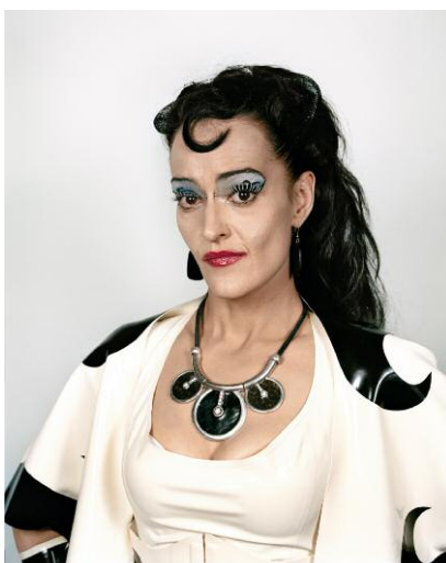
5 LADY XARA • Berlin, 2013