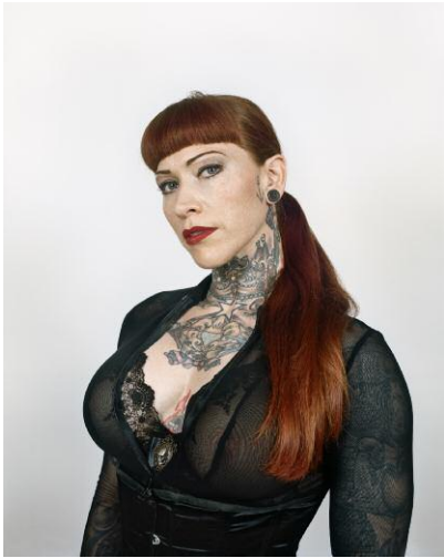
7 LADY ALEXA • Frankfurt, 2016