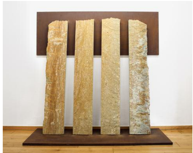
02 ESTELADA, 2013