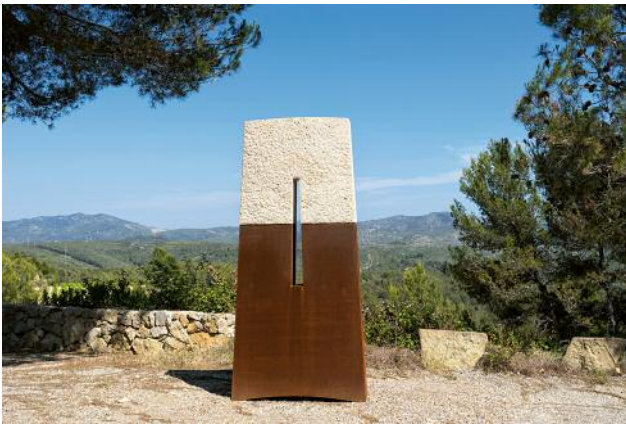
09 VIDAS HORIZONTALES, 2014, Parque des Esculturas, Can Maginet