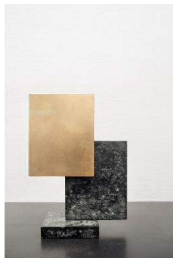
06 EDITION GELSENKIRCHEN/ HERNE, 2018