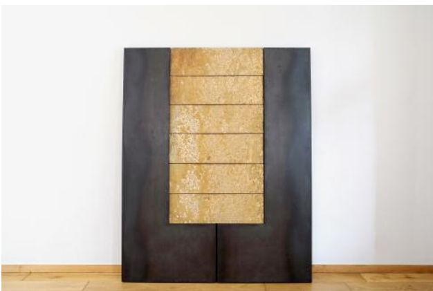
05 NO TITLE, 2012