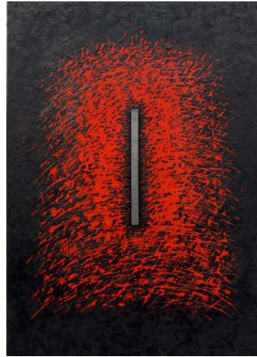
08 NO TITLE, 2017