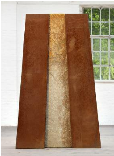
03 MASTABA, 2013