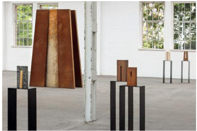
04 Exhibition view, Flottmann-Hallen Herne