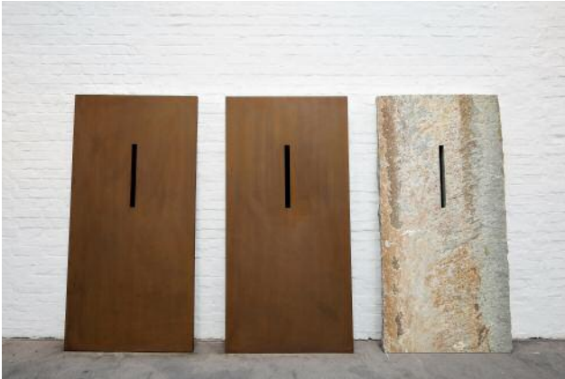
01 TRIPTYCH (FOR ELIOT), 2004