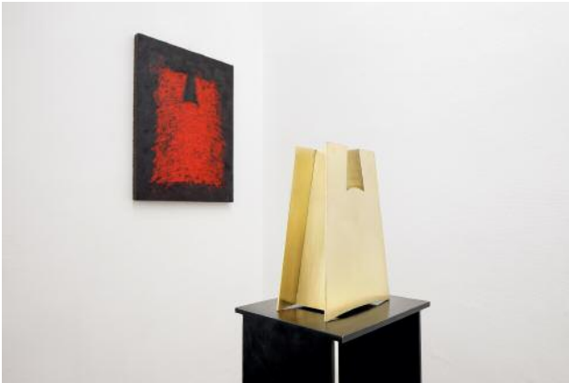
07 Exhibition view, Kunstmuseum Gelsenkirchen Front: TORREÓN, 2019 / Back: TORREÓN, 2017, Photo: © Enrique Asensi, Benito Barajas, Ralf-P. Seippel, Dani Rovira