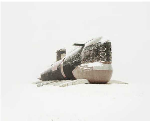
Press Image 3 © Danila Tkachenko