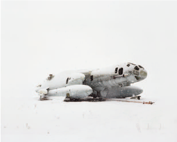
Press Image 1