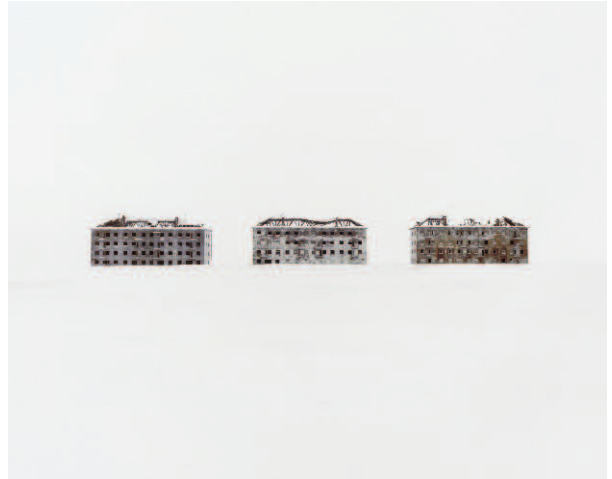
Press Image 2