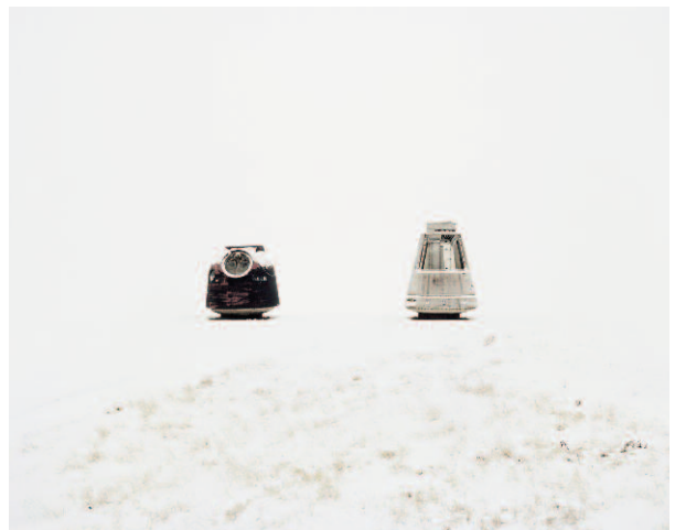
Press Image 4