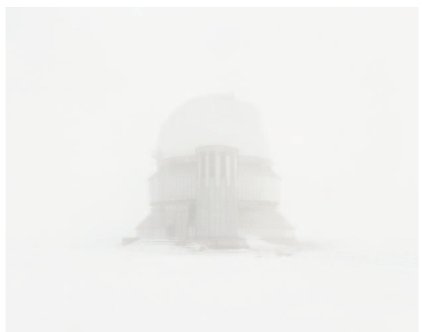
Press Image 6