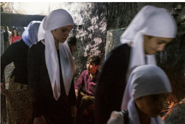
11_A group of young worshippers walk between rooms inside Lalish temple; in the background, a boy guards one of the shrines. The religion celebrates the sun and light as manifestations of God, and many Yazidi rituals involve fire.