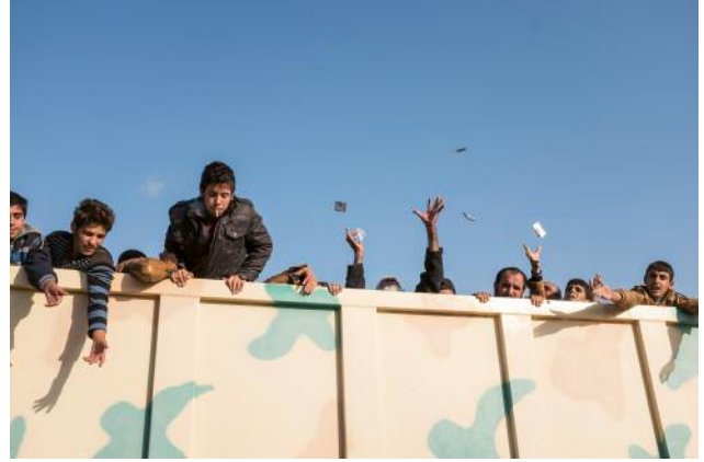
8_Men loaded in the back of a truck try to catch packs of cigarettes thrown at them by peshmergas. Smoking was forbidden under ISIS and punishable by imprisonment.