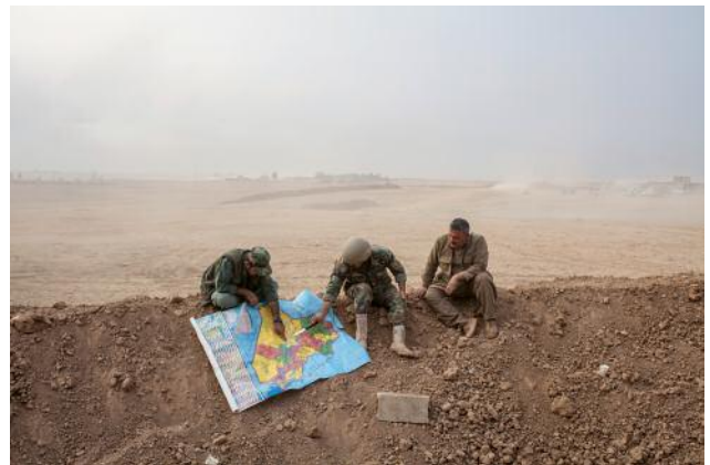
4_ Three peshmergas look at a map after a day of fighting.