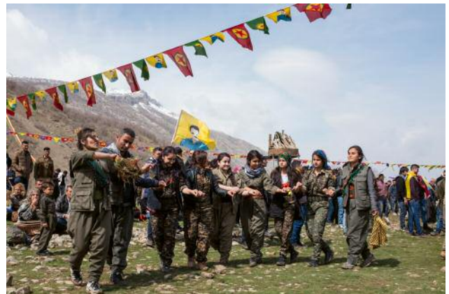
6_ A group of female guerrillas dance in Qandil during Newroz (Persian New Year).