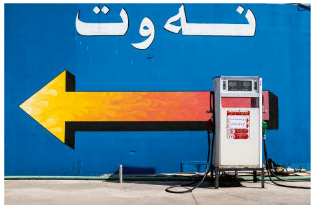
12_Detail of a petrol station near Sulaymaniyah.