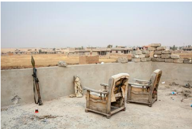
3_ A peshmerga rooftop observation post.