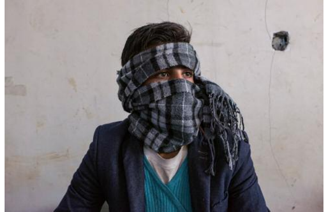
2_ Unaccompanied boy poses for a portrait in the shelter run by the Italian NGO Terre des Hommes in the Debaga camp.