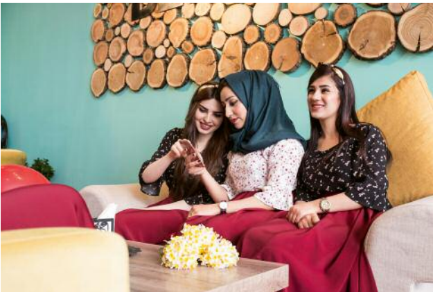
9_Three young women enjoy themselves at a book café open by a female entrepreneur in Erbil's new compound Dream City.