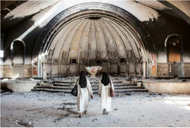
7_Two sisters of the Dominican Order of Saint Catherine walk inside the Church of Saint Banham and Saint Sarah in Qaraqosh. The church had been devastated during ISIS occupation. © Eugenio Grosso