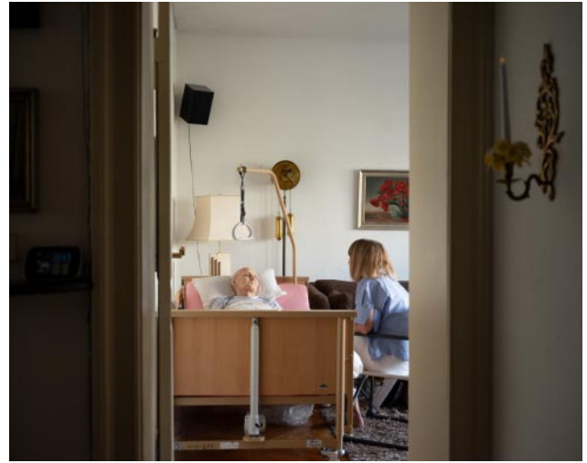
08_ © Sibylle Fendt