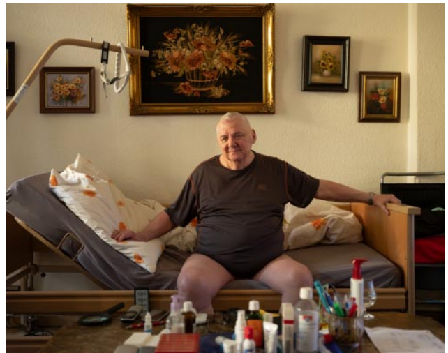
10_ © Sibylle Fendt