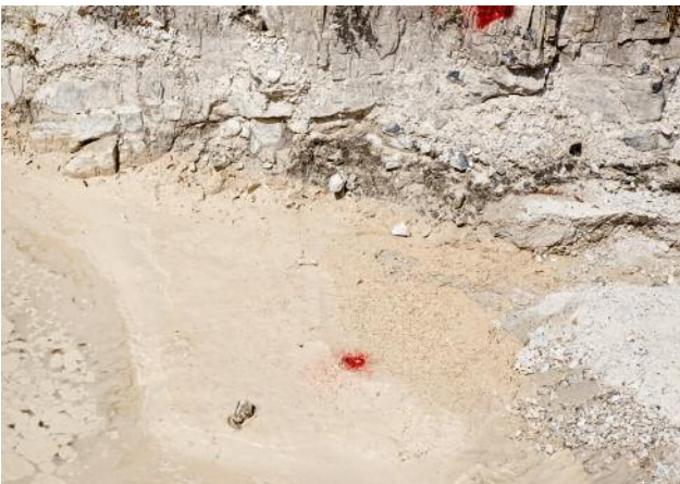
5 © Francesca Catastini