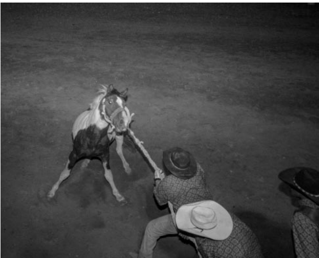
11 © Francesco Anselmi