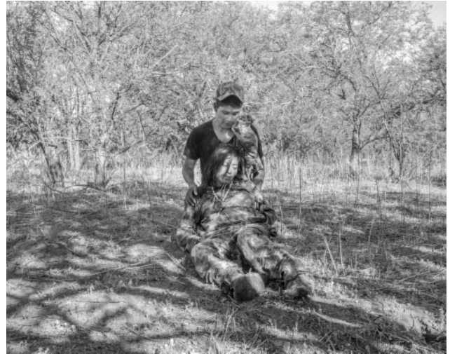
02 © Francesco Anselmi