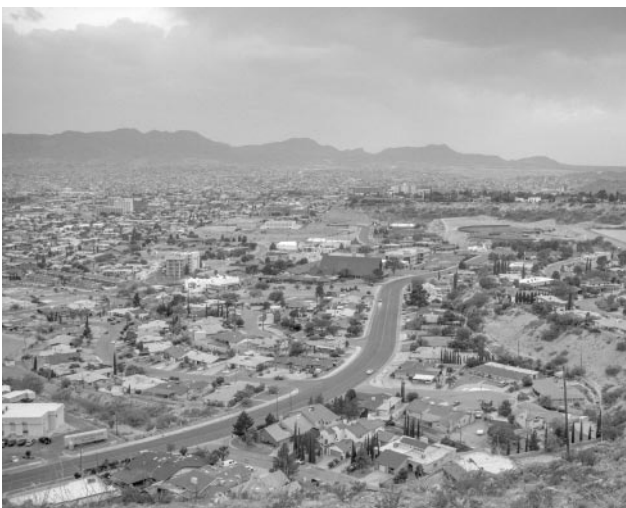
05 © Francesco Anselmi