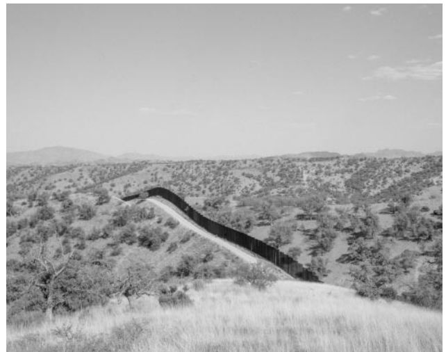
12 © Francesco Anselmi