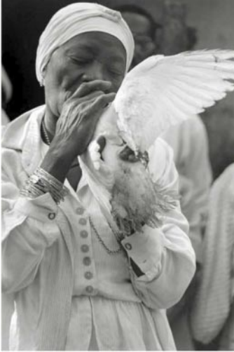
07_ Santera. Matanzas, 2001