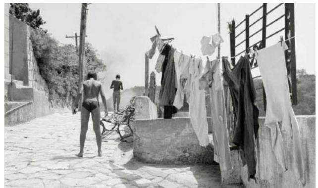
06_ Isla Granma, Santiago de Cuba, 2000