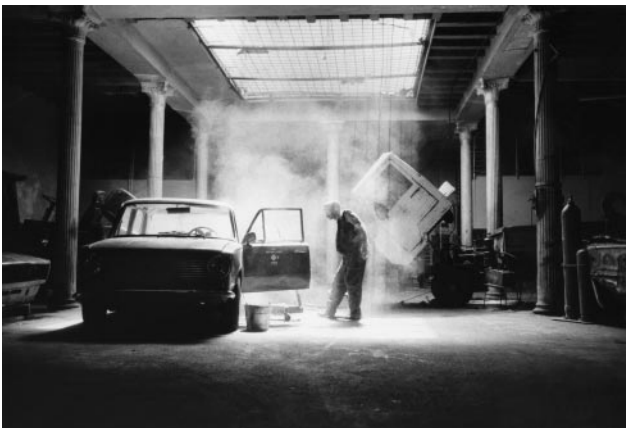
03_ Havana, 1998