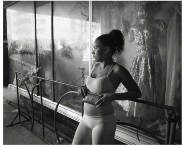
10_ Havana, 2016