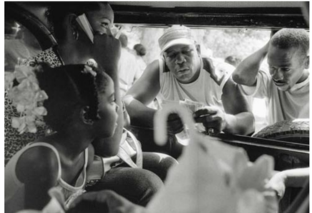
08_ Taxi Particular. Havana, 2006 © Claire Garoutte