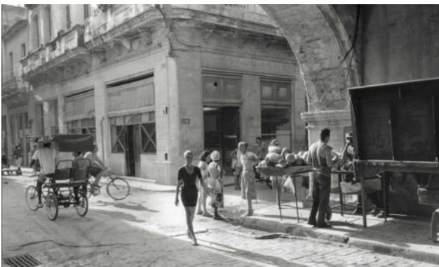
05_ Arco de Belén. Havana, 2000