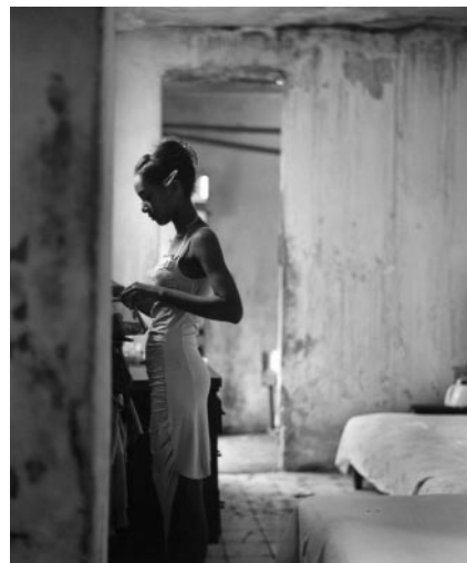
04_ © Havana, 2015 © Claire Garoutte