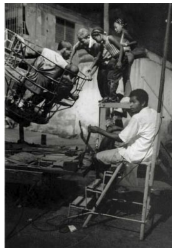
12_ Carnaval. Santiago de Cuba, 2006