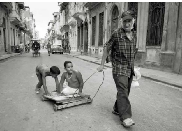
11_ Havana, 2022