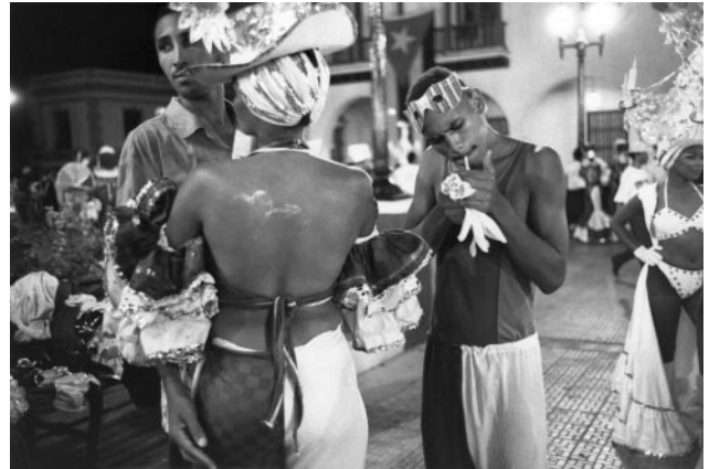
02_ Carnaval. Santiago de Cuba, 2006