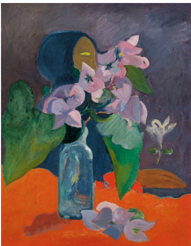
09_ Stilleben mit Blumen und Idol, um 1892 © Paul Gauguin