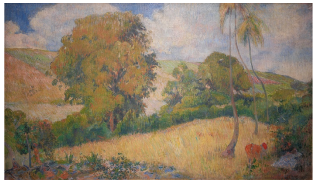
04_ Wiese auf Martinique, 1887 © Paul Gauguin