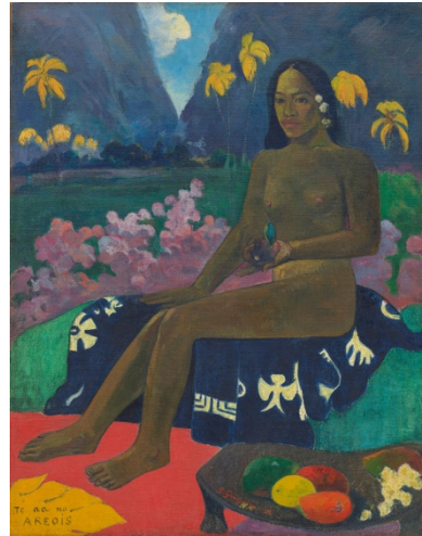
08_ Te aa no Areois – Der Samen der Areoi, 1892 © Paul Gauguin