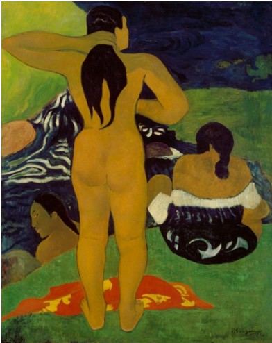
07_ Tahitianerinnen beim Baden, 1892 © Paul Gauguin