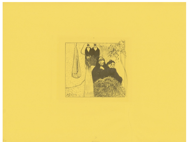
06_ Die alten Jungfern in Arles, aus der Suite Volpini, 1889 © Paul Gauguin