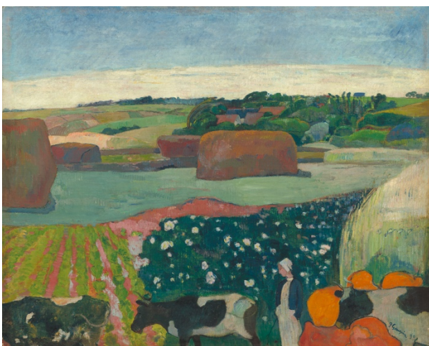
05_ Heugarben in der Bretagne, 1890 © Paul Gauguin