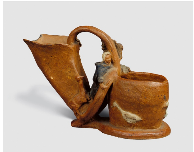
02_ Gefäß mit bretonischem Mädchen, Schaf und Gänsen, 1886/87 © Paul Gauguin