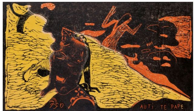
10_ Auti Te Pape – Spiel im Süßwasser, aus der Suite Noa Noa, 1893/94 © Paul Gauguin