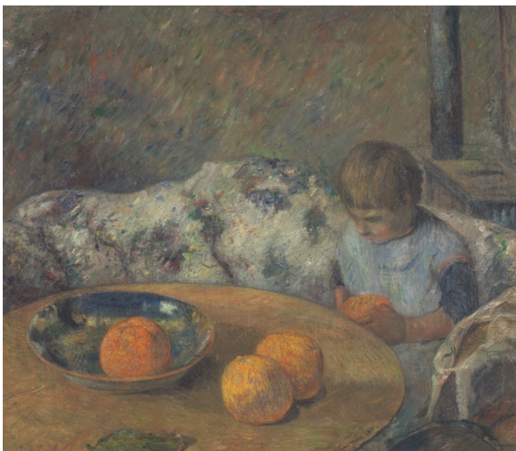
03_ Interieur mit Aline 1881 © Paul Gauguin