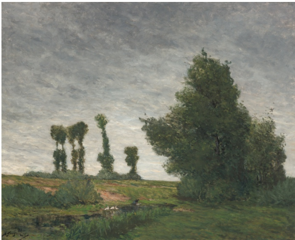
01_ Landschaft mit Pappeln, 1875 © Paul Gauguin