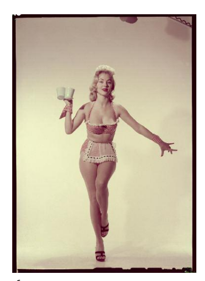
16 © Peter Gowland