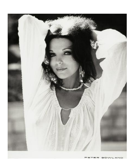
23 © Peter Gowland