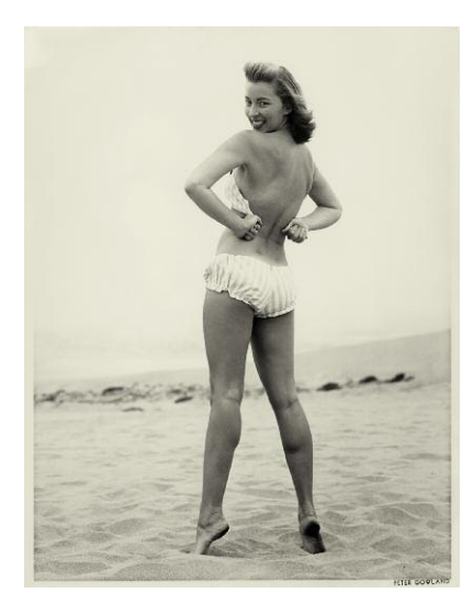
5 © Peter Gowland