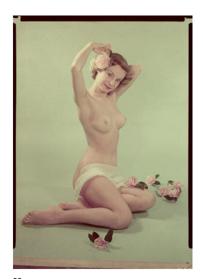
22 © Peter Gowland