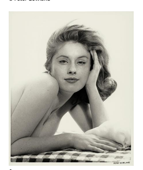
6 © Peter Gowland