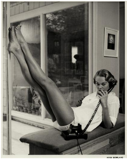
21 © Peter Gowland