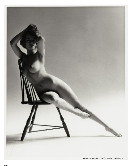
15 © Peter Gowland