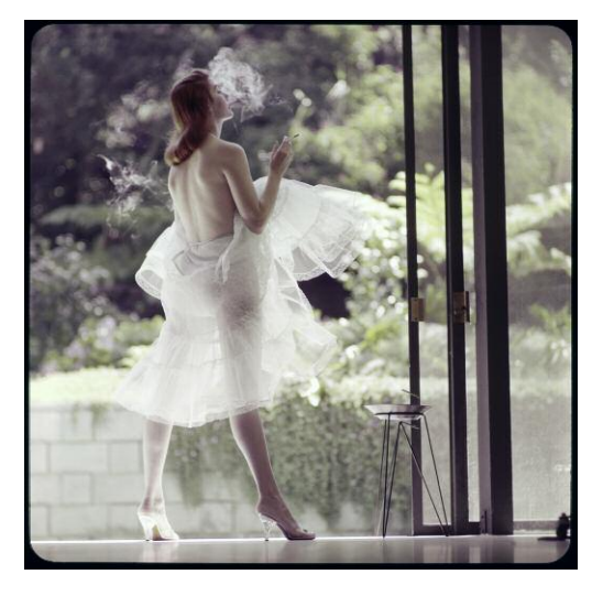
14 © Peter Gowland