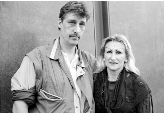
09_ Helga Paris. Mein Alex series. Untitled