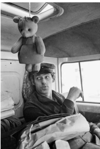
05_ Helga Paris. Affections series. Untitled 1