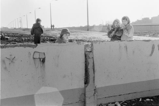
07_ Helga Paris. Faces and Houses series. Untitled 3 © Estate Helga Paris