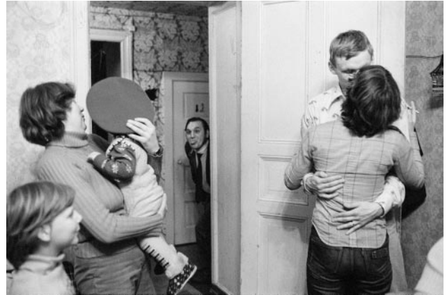
02_ Helga Paris. Affections series. Party the Night Before the Wedding at the Schurigs', Berlin, 1976