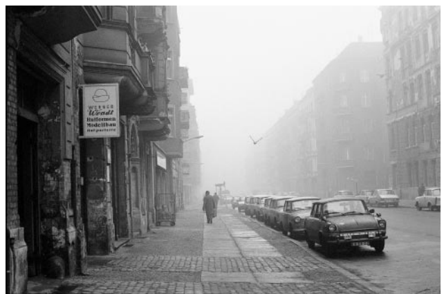
06_ Helga Paris. Faces and Houses series. Winsstraße mit Taube, 1970 © Estate Helga Paris