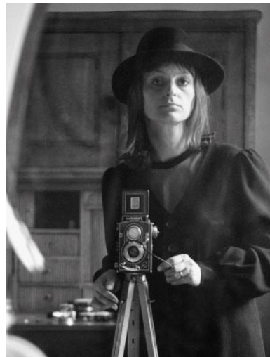
10_ Helga Paris. Self-Portrait, Berlin, 1968 © Estate Helga Paris