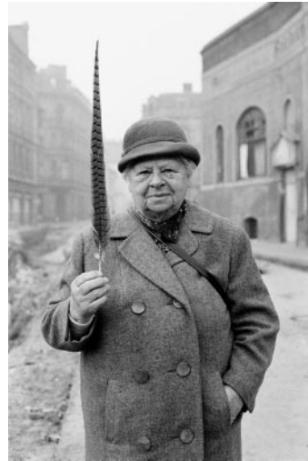
08_ Helga Paris. Faces and Houses series. Untitled 1