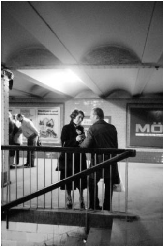
01_ Helga Paris. Affections series. New Year's Eve, 1980 © Estate Helga Paris