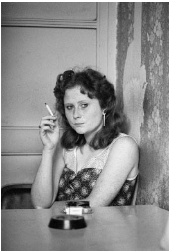
03_ Helga Paris. Women at the Treff-Modelle Clothing Factory series. Untitled 1